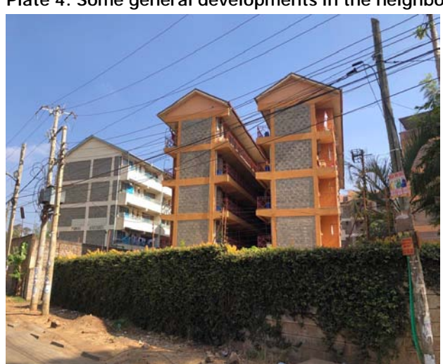
Plate 4: Some general developments in the neighborhood

Similar high-rise developments have been implemented in the general neighborhoods while others are ongoing.