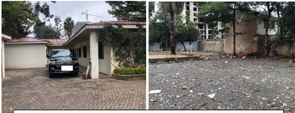
Part of the proposed site with a house to be demolished to pave way to the proposed project

(GPS Coordinates: Latitude -1.296537, Longitude 36.785767)