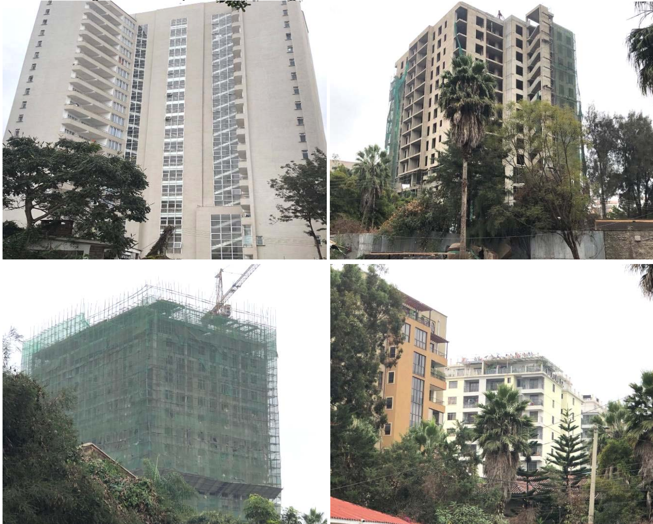
Plate 4: Some general developments in the neighborhood