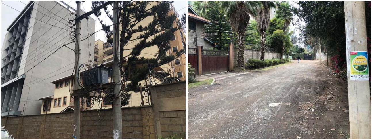
Plate 2: Part of infrastructural development in the area

The immediate access road is Wood Garden Road that is well connected to other roads including Wood Avenue and therefore the site is well accessible.