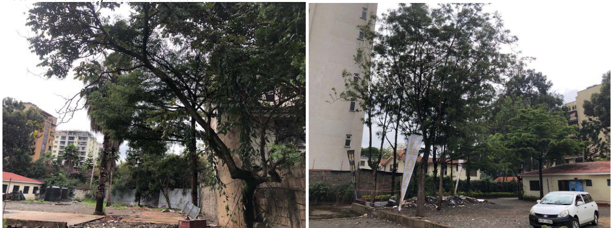
Plate 1: Part of vegetation at the site

There is no fauna/wildlife threatened by the development.