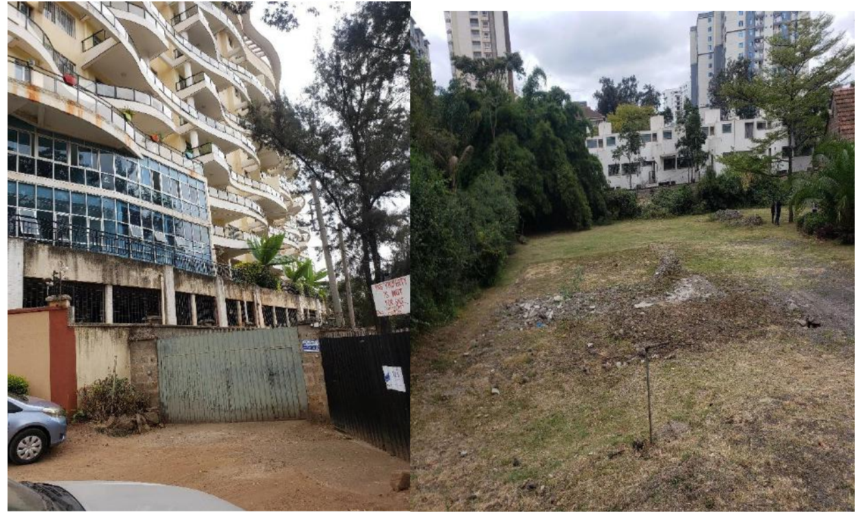
Figure 1. Proposed project Neighbourhood and project site respectively

The proponent owns the parcel of land Plot LR No. 19/255, along George Padmore road, Kilimani, Nairobi County. The proposed project is located on coordinates (1^{\circ}17'43''S 36^{\circ}47'36''E) as shown by the pin drop in the Figure 2 below. The proposed project is in line with the zoning of the area and the project neighbourhood comprises of multi-dwelling units.