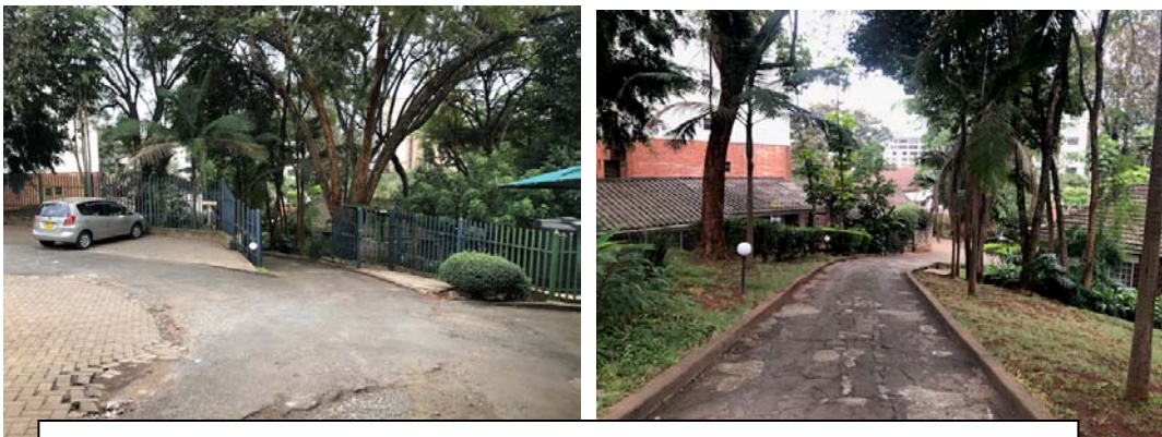
Part of the proposed site with a house to be demolished to pave way to the proposed project

(GPS Coordinates: Latitude -1.266653, Longitude 36.793438)