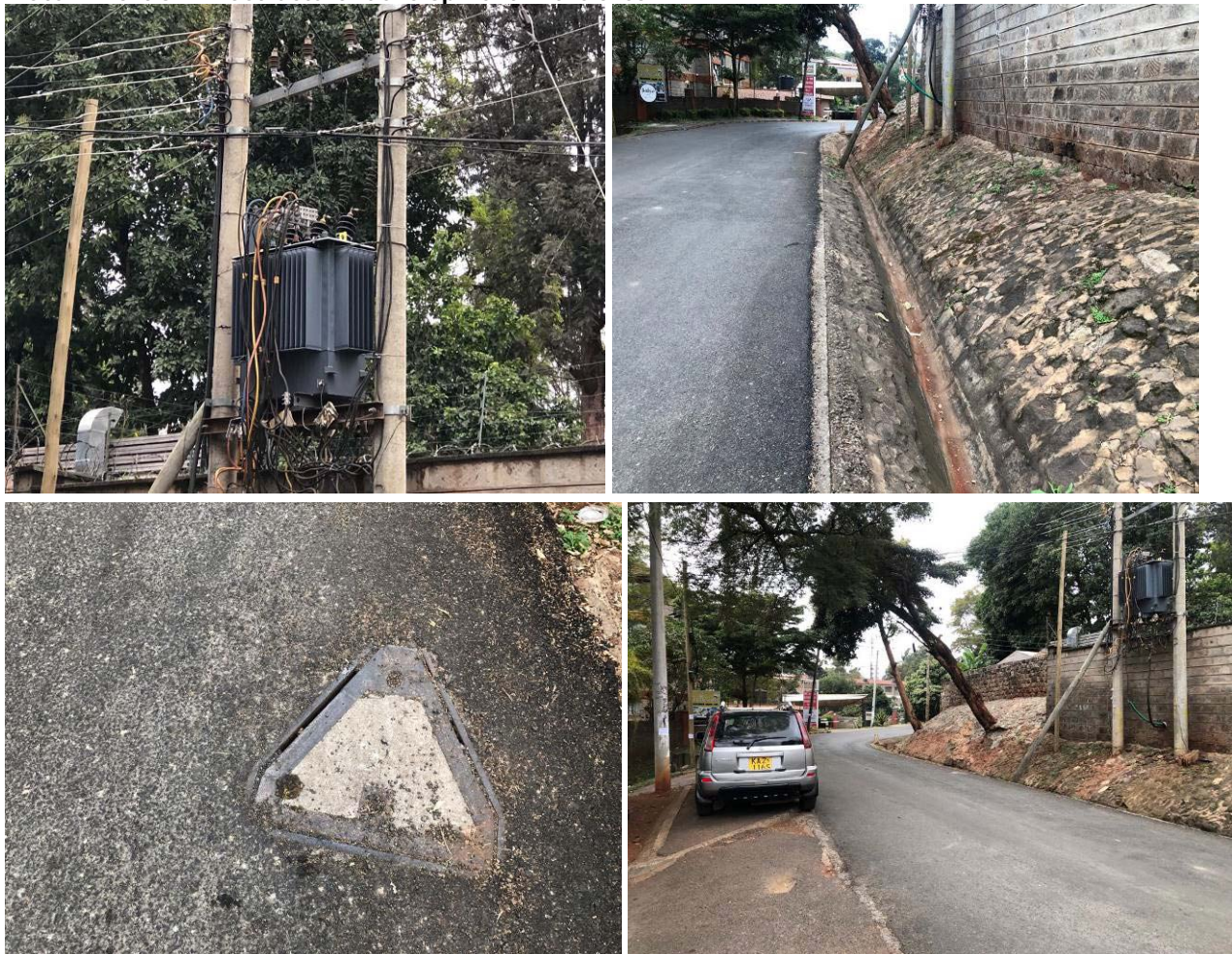
Plate 2: Part of infrastructural development in the area

The immediate access road is East Church Road that is tarmacked and well connected to other roads and therefore the site is well accessible.