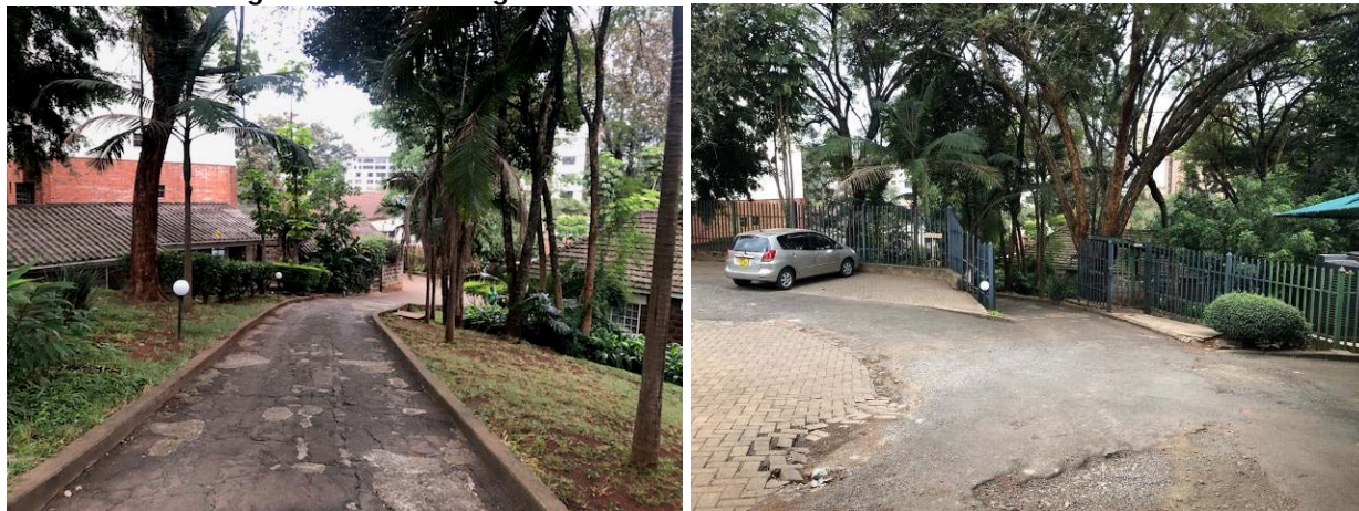
Plate 1: Part of vegetation in the neighborhood

There is no fauna/wildlife threatened by the development.