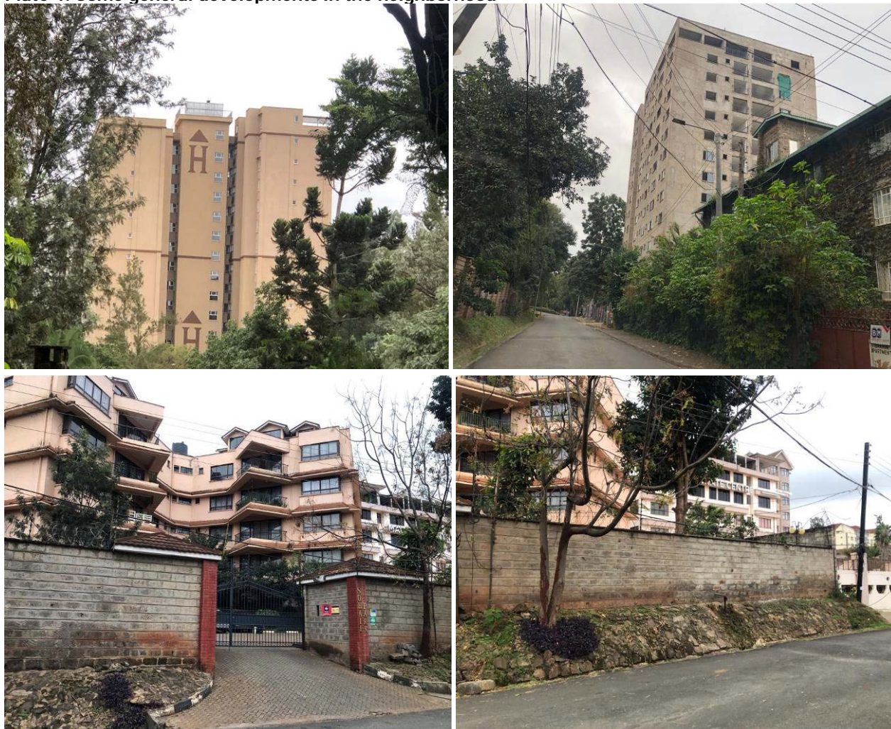
Plate 4: Some general developments in the neighborhood