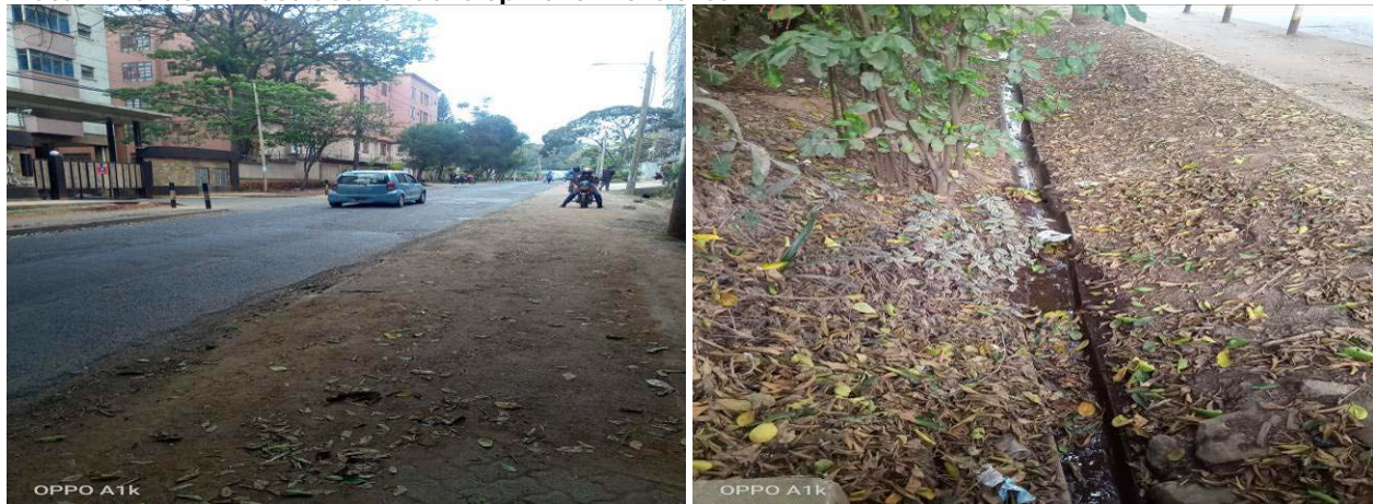
Plate 2: Part of infrastructural development in the area

The immediate access road is Mararo/Argwings Kodhek Road which are tarmacked and well connected to other roads and therefore the site is well accessible.