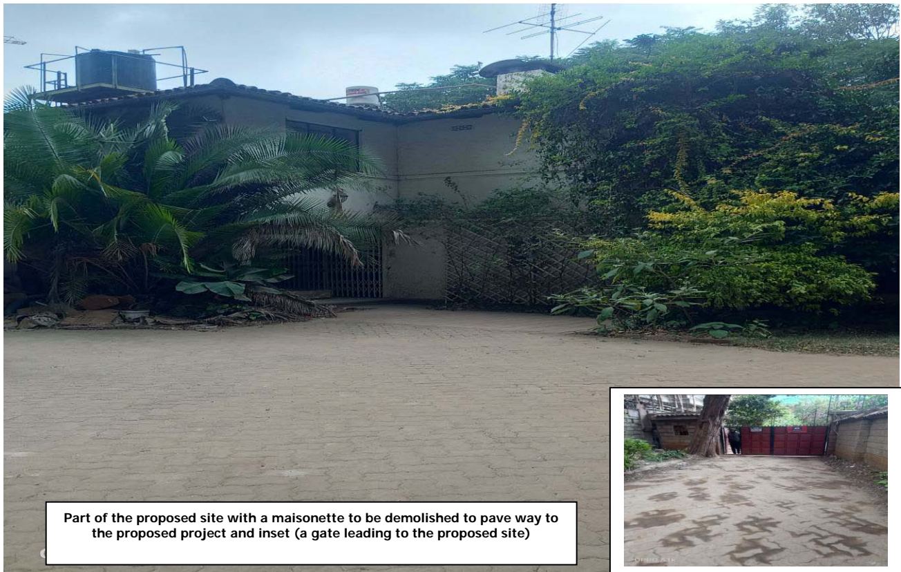
Part of the proposed site with a maisonette to be demolished to pave way to the proposed project and inset (a gate leading to the proposed site)

(GPS Coordinates: Latitude -1.292551, Longitude 36.773077)