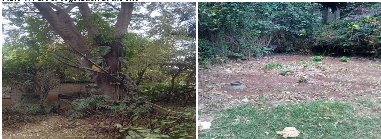
Plate 1: Part of vegetation at the site

There is no fauna/wildlife threatened by the development.