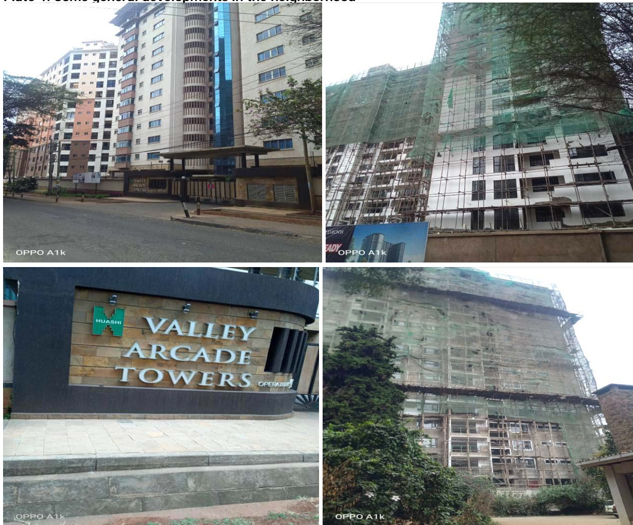
Plate 4: Some general developments in the neighborhood

Similar high-rise developments have been implemented in the general neighborhoods while others are ongoing.