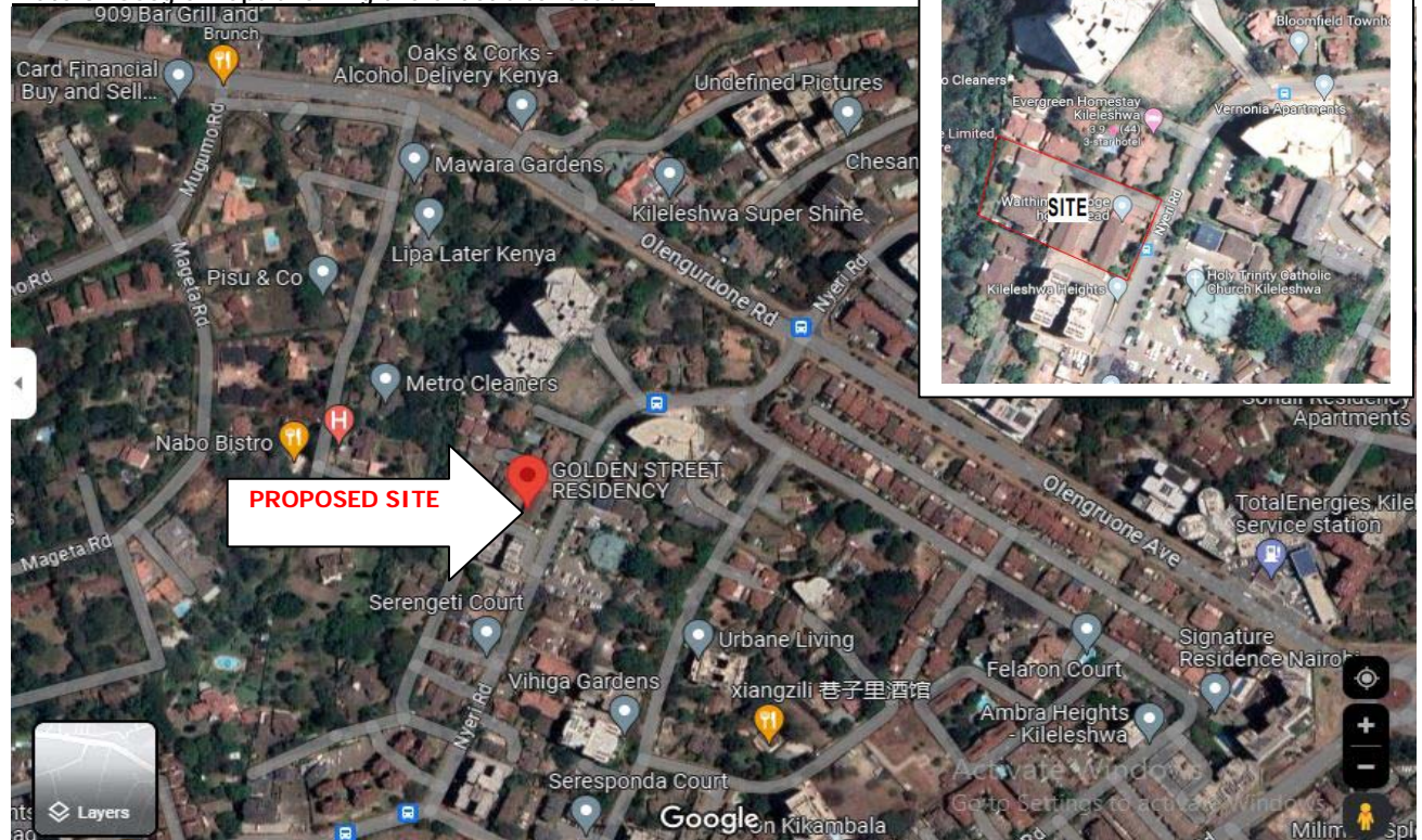
Plate 3: Google maps showing the exact site location

The proposed project site is Land Reference Number Nairobi/Block 23/44 (Original No. 209/9676) along Nyeri Road in Kileleshwa, Nairobi County. It is located directly opposite the Holy Trinity Catholic Church Kileleshwa.