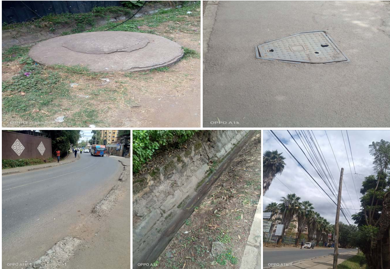
Plate 2: Part of infrastructural development in the area

The immediate access road is Nyeri Road that is tarmacked and well connected to other roads including Ring Road Kileleshwa, Oloitoktok Road and therefore the site is well accessible.