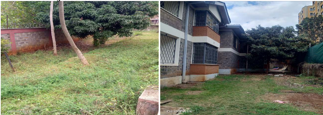
Plate 1: Part of vegetation at the site

There is no fauna/wildlife threatened by the development.