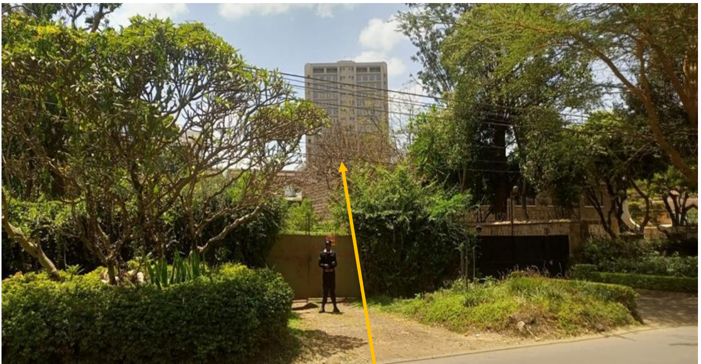
Photo 2: Showing the proposed site and similar project design in magnitude behind it. Next to the proposed site is Marina Bay building that is above 17 floors whose construction is almost complete.

The proposed project will be developed on Plot No. NAIROBI/BLOCK4/174 located along Sports Road in Westlands Area, Nairobi County. The geo spatial attributes in terms of Global Positioning System (GPS) site are Latitude -1.263980 S, Longitude 36.797538 E. The general area is characterized by apartments and other commercial set-up. This therefore means that the proposed project is in character with the developed and ongoing developments of apartments in Westlands Area.