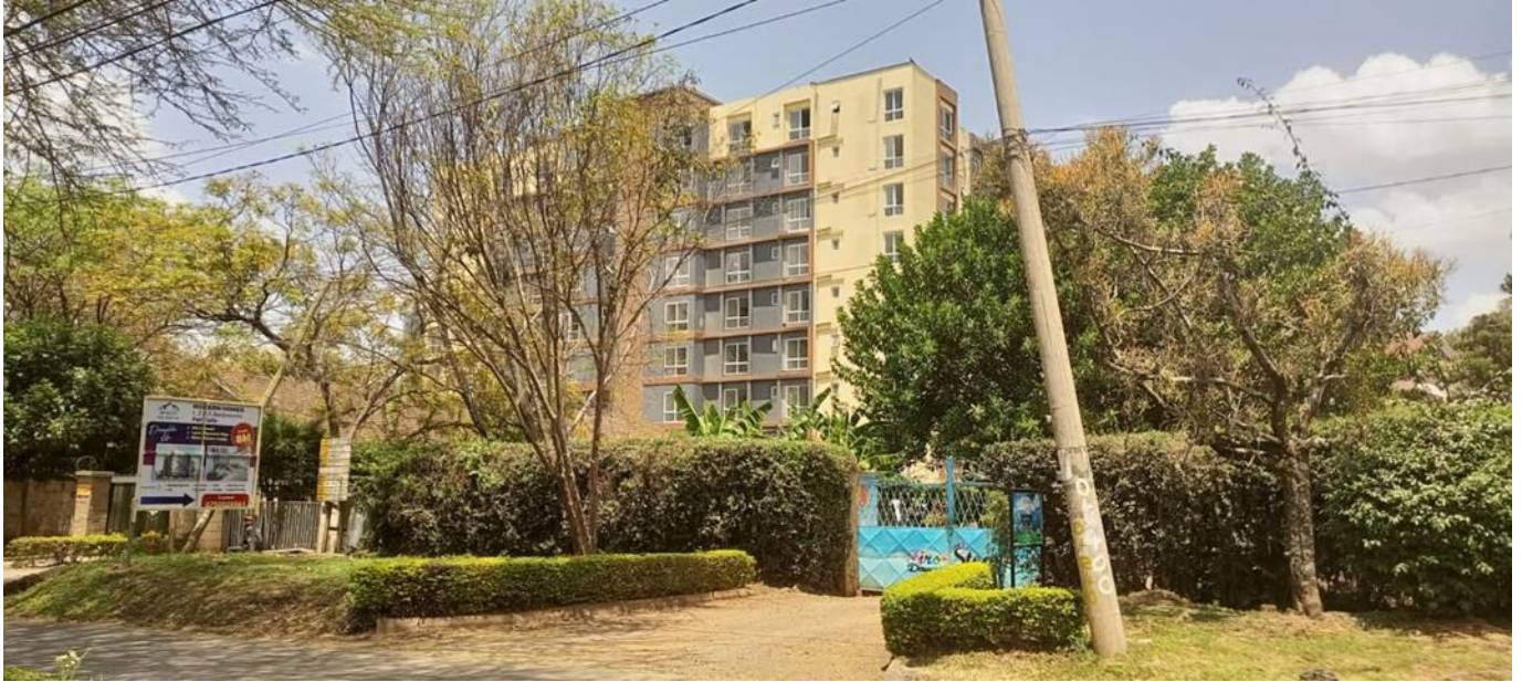
Photo 6: Showing similar housing typology opposite the proposed site.