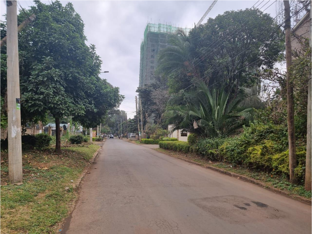
Photo 9: Showing Sports Road along which the proposed site is located