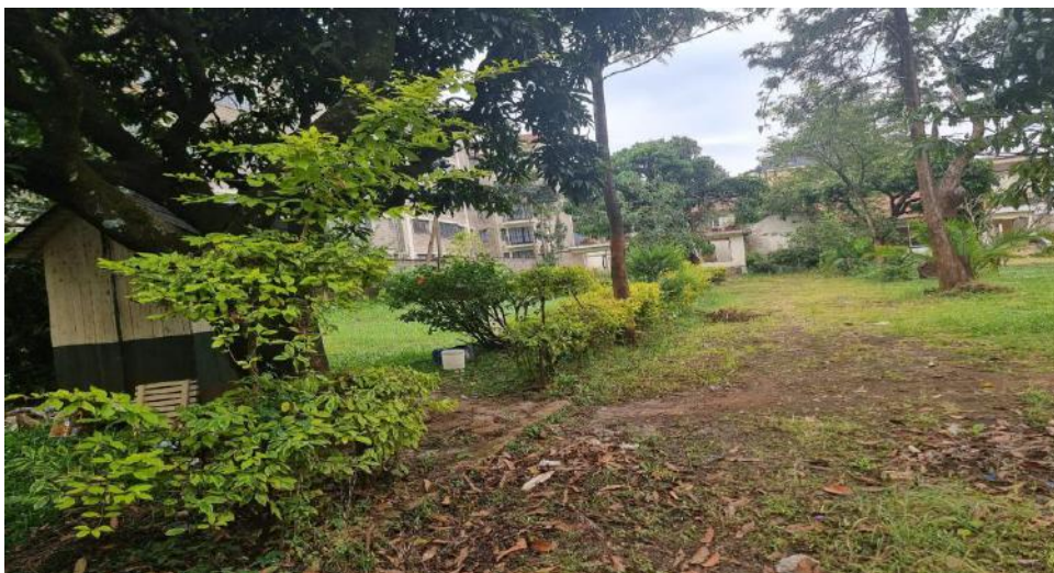
Photo 4: Showing the proposed site with indigenous trees that will be cleared to pave way for the proposed project.

Communities in these rivers comprise of Producers mainly; autotrophic phytoplanktons and higher Plants (macrophytes), macro-consumers such as zooplankton, Macro invertebrates like the Oligochaetes, and leeches are common highly polluted Rivers like these of Nairobi. Also present are frogs and micro-consumers chiefly bacteria, fungi, which are responsible for the degradation of the particulate or dissolved organic substances by autotrophic processes or coming from allocthonous sources.