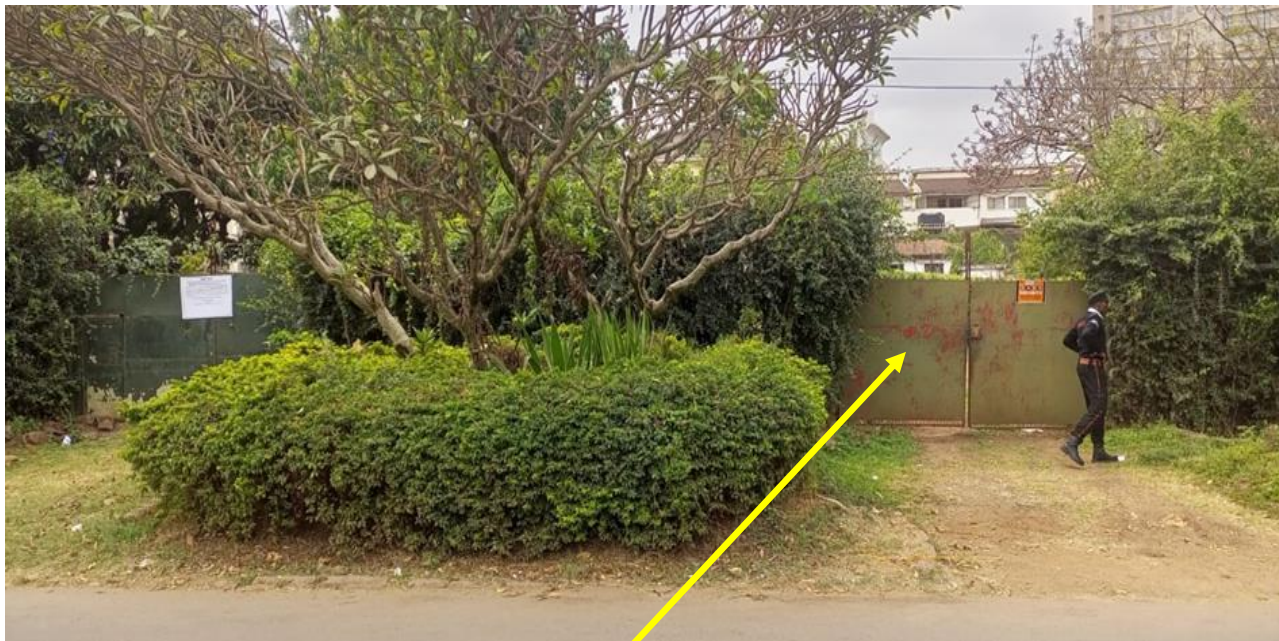
PROPOSED PROJECT SITE