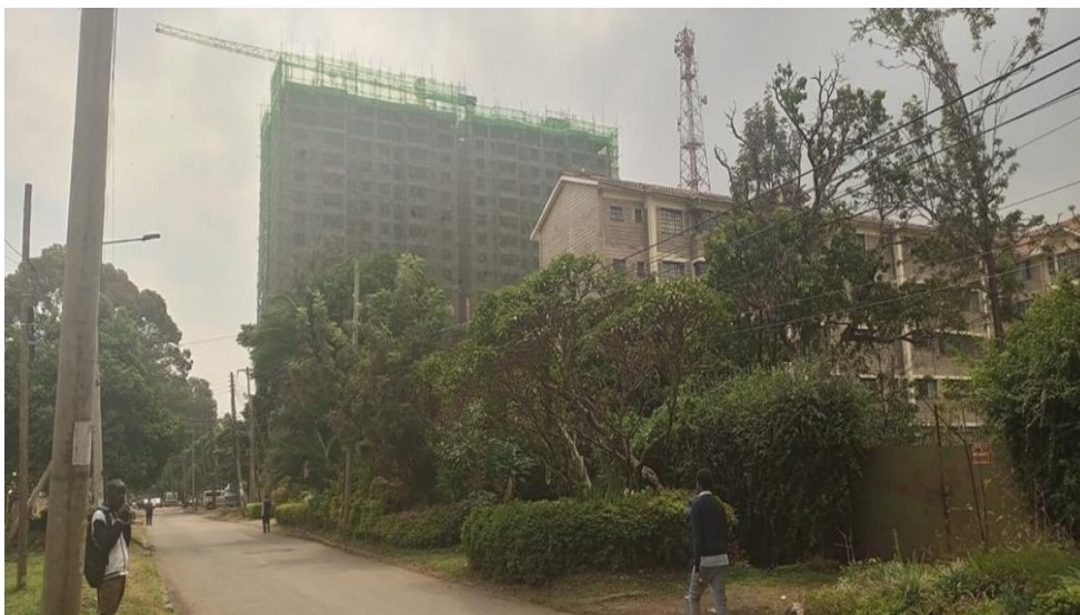
Photo 5: Showing on-going project similar in magnitude along sports road