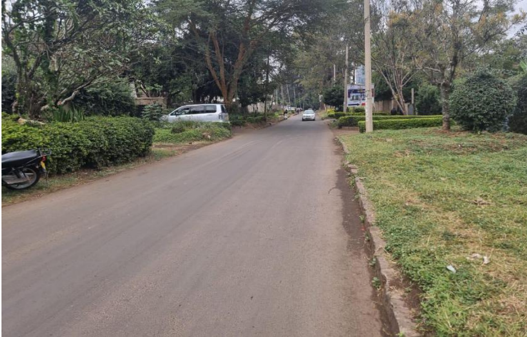
Photo 8: Showing Sports Road along which the proposed site is located. The site will be accessed using this road.

The proposed site is located along Sports Road off Rhapta Road via Waiyaki Way. Alternatively, the proponent can access the site via David Osieli Road off Waiyaki Way and connect Sports Road that can easily connect to the site.