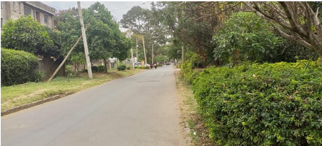
Photo 3: Showing site accessibility along Sports road, Westlands area.

The proposed site is located along Sports Road in Westlands Area. The proponent will use the same road to access the proposed site.