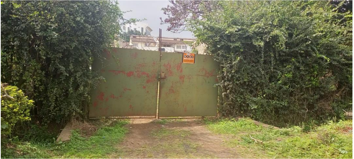
Photo 1: Showing an access gate. This will be the main access into the property.

Construction materials being used are stones, cement, timber, tiles, and paints, steel among other modern materials. There will be generation of waste materials during construction of the project. The proponent is advised to landscape the proposed development on completion so as to enhance its aesthetics value and ensure its sustainability. Also, the proponent will use the existing communication networks and the existing road networks in the area.