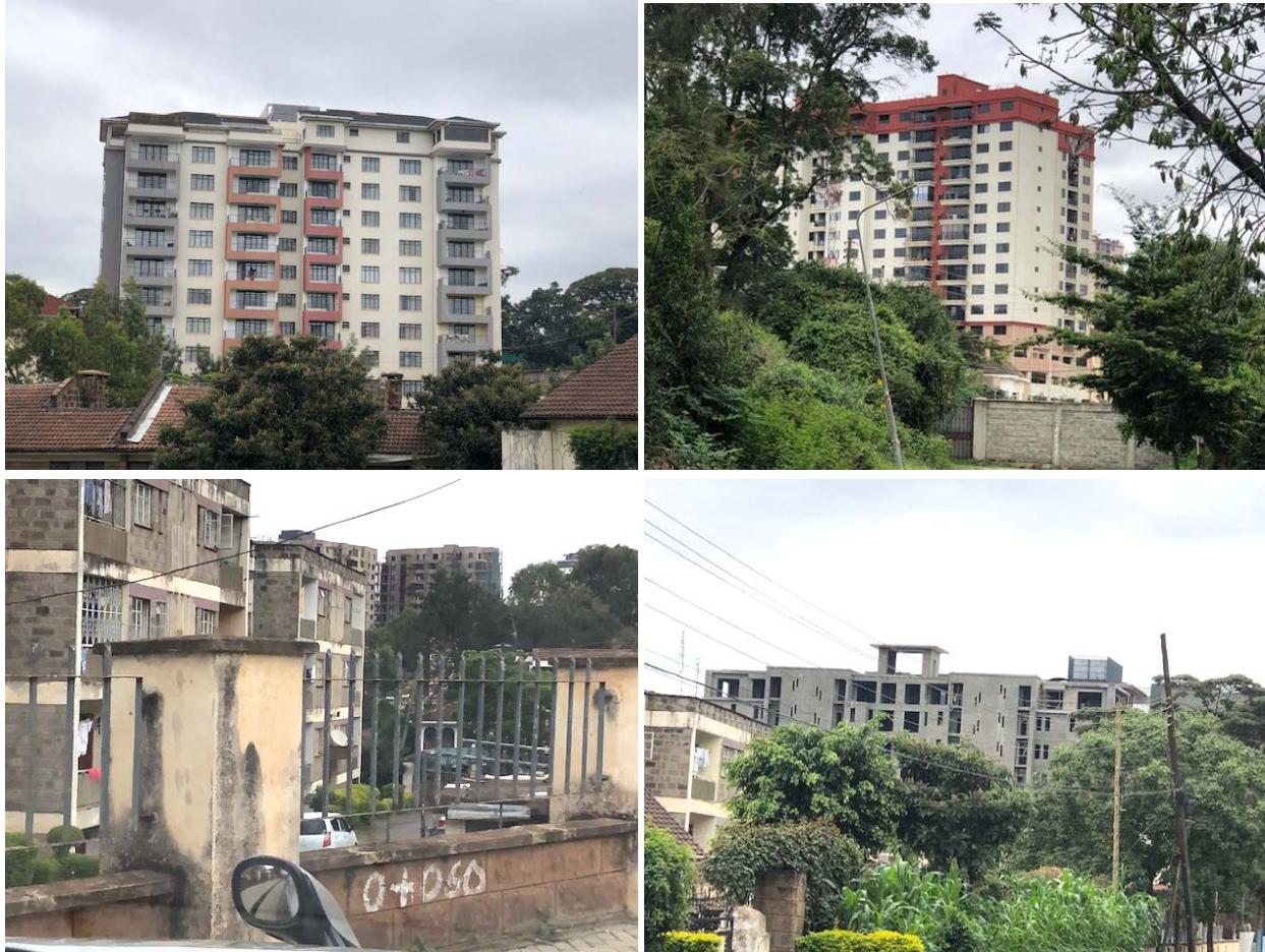
Plate 4: Some general developments in the neighborhood

Similar high rise developments have been implemented in the general neighborhoods and others are developed with town houses.