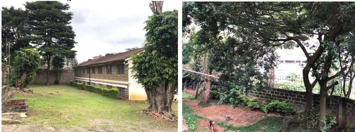
Plate 1: Part of vegetation at the site

There is no fauna/wildlife threatened by the development.