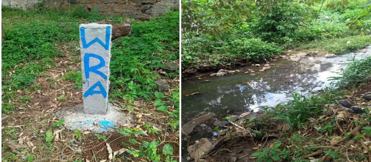
Plate 2: Pegging by WRA at the Kirichwa Kubwa River

Kirichwa Kubwa River that borders the proposed site can be termed as a sensitive ecosystem. The proponent should ensure that the river is protected from any kind of pollution during the entire project cycle. Pegging has already been done by the Water Resources Authority to ensure that the proposed project does not encroach into Kirichwa Kubwa River.