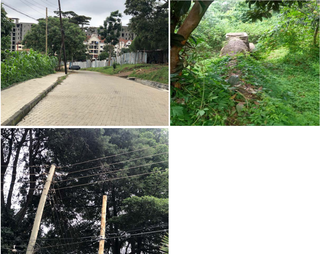
Plate 3: Parts of Likoni Lane, existing sewer and power systems in the area