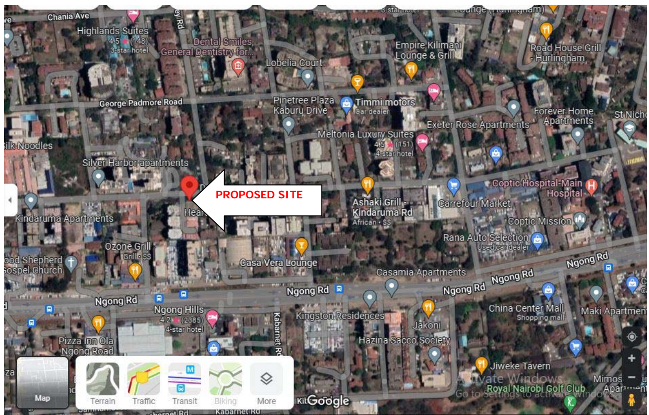
Plate 2: Google maps showing the exact site location

The proposed project site is Land Reference Number Plot L.R No. 1/437 (Original No. 1/432/3) along Kindaruma Road in Kilimani, Nairobi County.