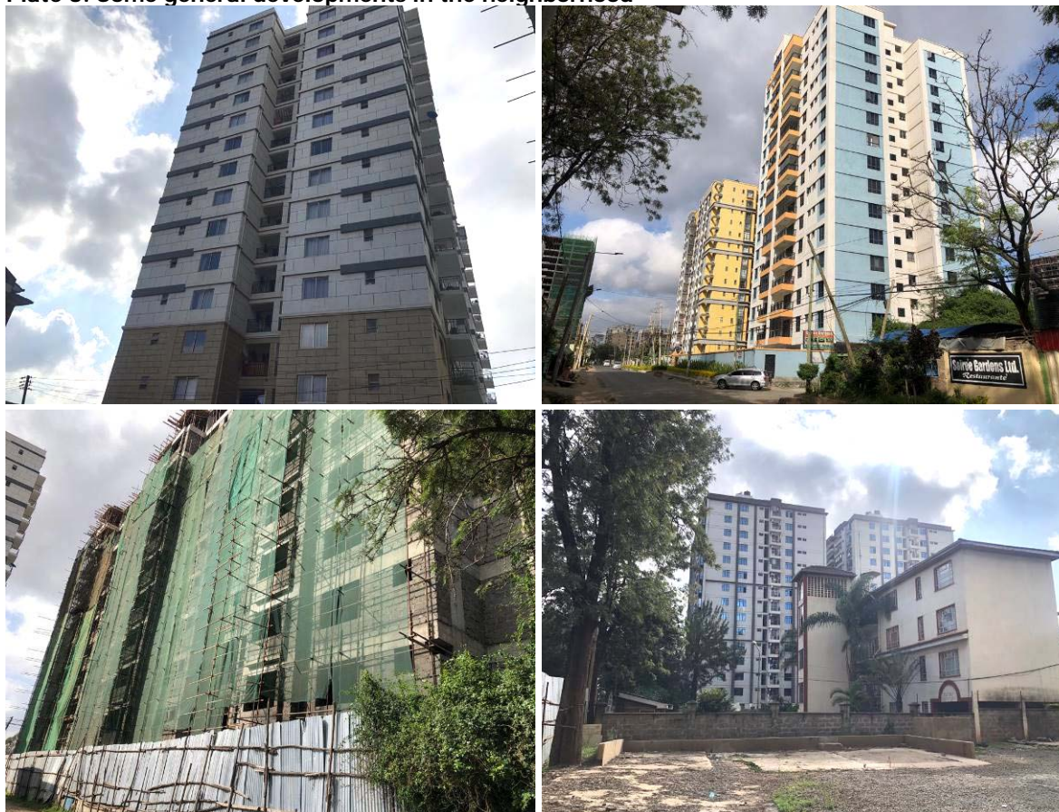
Plate 3: Some general developments in the neighborhood

The proposed project site is Plot L.R No. 1/437 (Original No. 1/432/3) along Kindaruma Road in Kilimani, Nairobi County. From the proposed designs, the essential set local standards (in terms of physical planning, minimum habitable rooms, basic facilities, health and safety) have been met. The land is registered in the name of the proponent. (Please find the attached ownership documents). Similar high rise developments have been implemented in the immediate neighborhoods and others are under construction in the general neighborhood. A change of user has already been sought as shown below:-