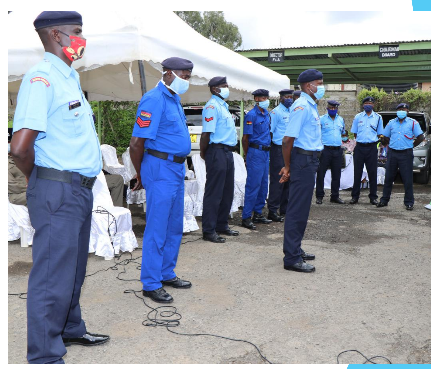
Police officers deployed to NEMA in May 2020

The officers also conduct regular surveillance to detect environmental crimes as well as apprehending and prosecuting environmental offenders. In this regard, the NEMA police Unit has strengthened prosecutions of environmental cases across the country while serving as deterrent to potential environmental offenders.