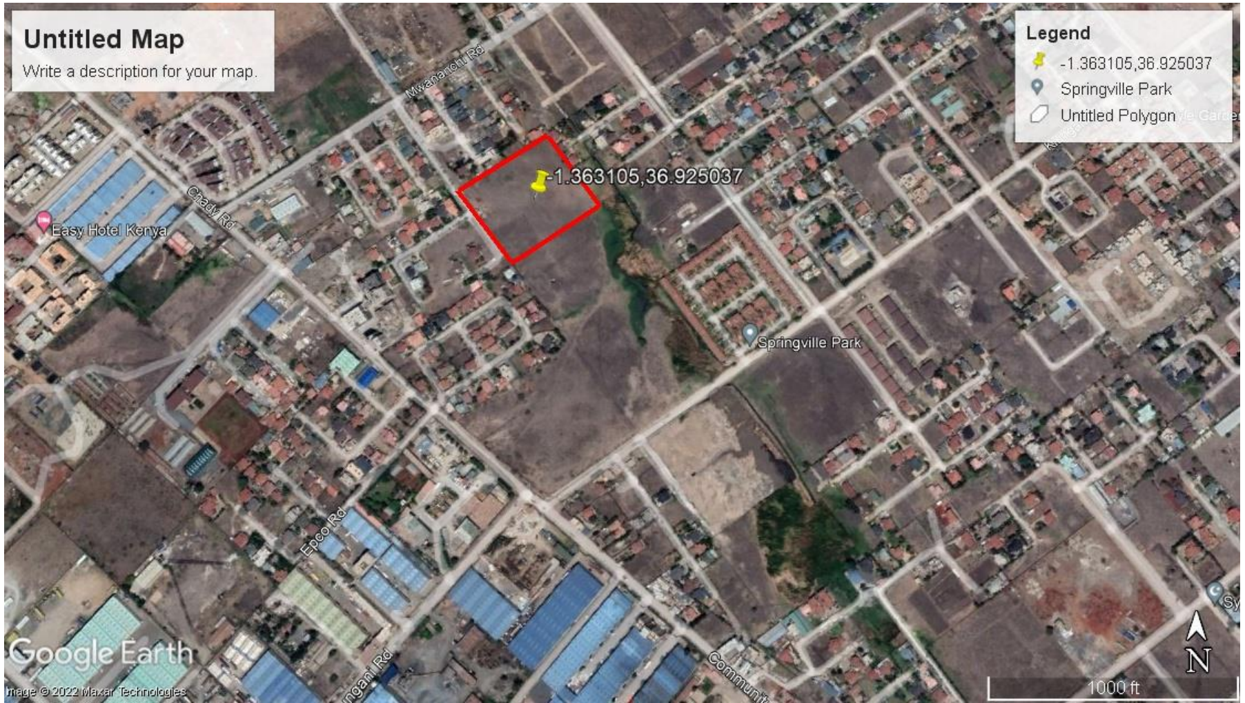
Figure 1: Proposed site location