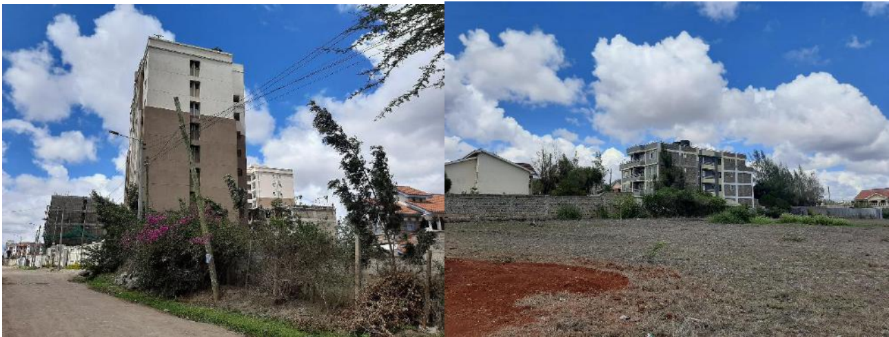
Figure 2: Neighbouring similar development

The proposed project site is currently developed with a townhouse designed to host a single family. The site falls within a residential area with several apartments and associated developments including a road network, electricity supply and other infrastructure. It is accessed through a well tarmacked road. The current land use of the plot is residential use.