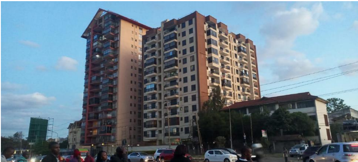
Some of nearby and easily sported flats along Ngong Road, which is near the proposed project site