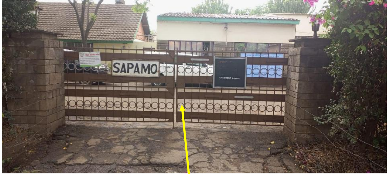
PROPOSED PROJECT SITE