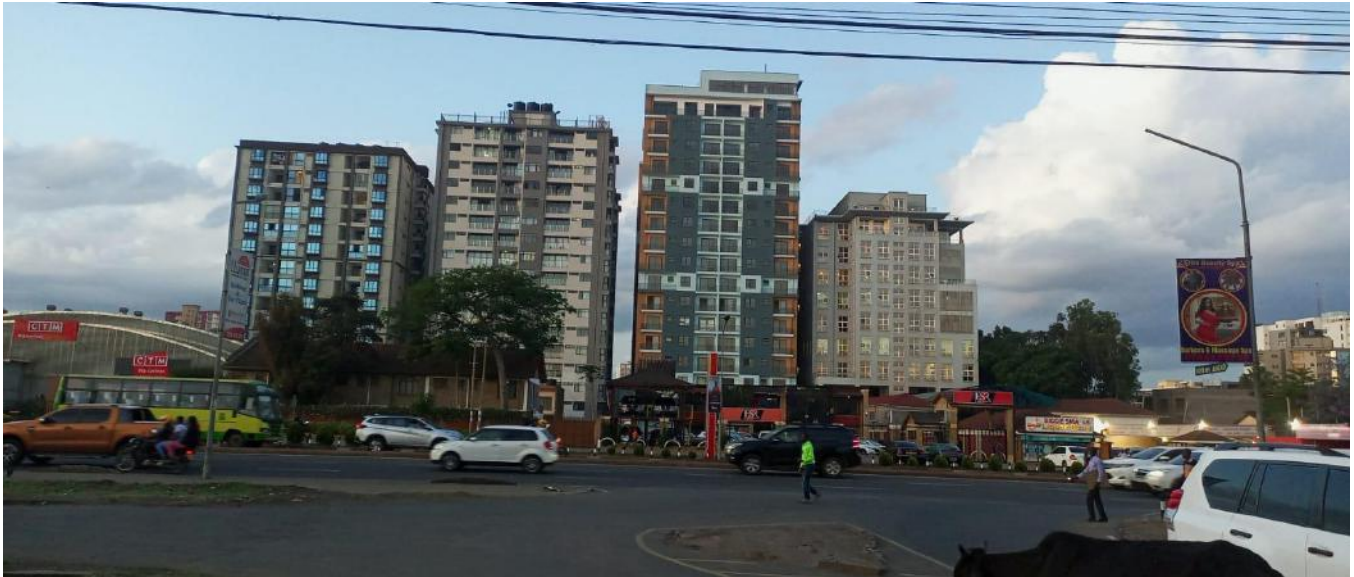
Similar development in magnitude along Ngong Road, which is opposite the project site in Kabarnet Road off Ngong Road

The proposed site is located along Kabarnet Road which stretches all the way from Ngong to Ring Road, off Ngong Road. The proponent will use Ring Road to join Kabarnet Road since the proposed site is at the corner of Ring Road and Kabarnet Road, this will help reduce traffic Congestion along Kabarnet Road. Alternatively, the proponent can access the site via Kabarnet Road off Ngong Road to enter the site and exist via Ring Road.