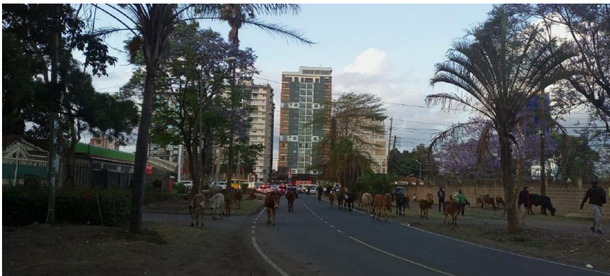
Kabarnet Road stretching from Ngong Road