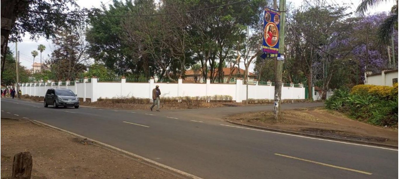
Photo 2: Showing status of Kabarnet Road used to access the proposed site. Opposite the site is Sudan Embassy that can be used as a landmark to access the site.

The proposed site is located along Karbarnet Road. The proponent will use the same road to access the proposed site.