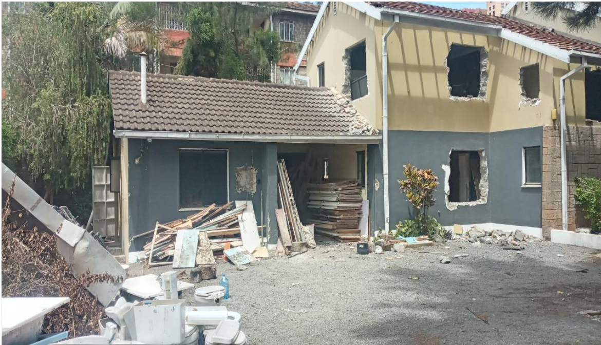
Figure 3: The project site photos