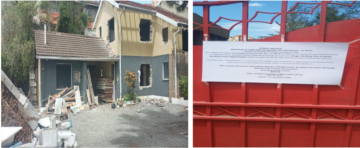
Figure 1: Proposed project site and change of use notice at the gate respectively

Vendome Realty Limited owns the piece of land LR no. 1/776 & 1/778, along George Padmore road, Kilimani area, Nairobi County on coordinates (-1.296018, 36.788725) as shown by the pin drop in the Figure 2 below. The development proponent has obtained a change of use to enable them put up the multi dwelling development (apartments) on the land that was previously utilized for single dwelling residential use.