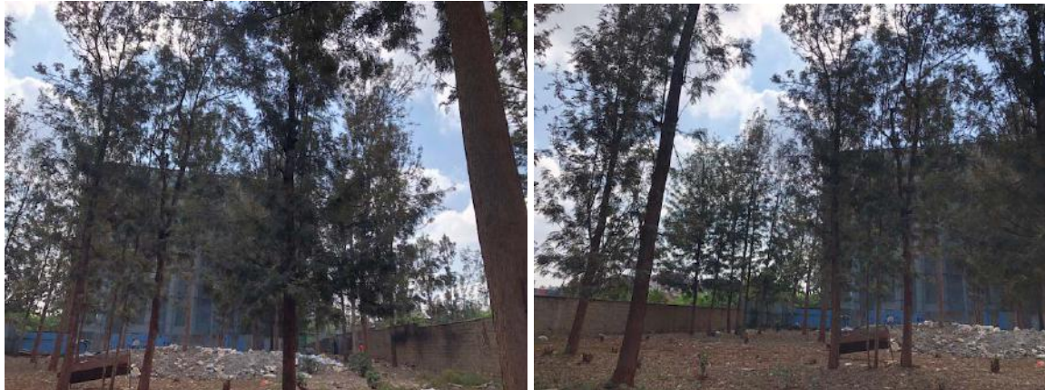
Plate 1: Part of vegetation and soil in the area

There is no fauna/wildlife threatened by the development.