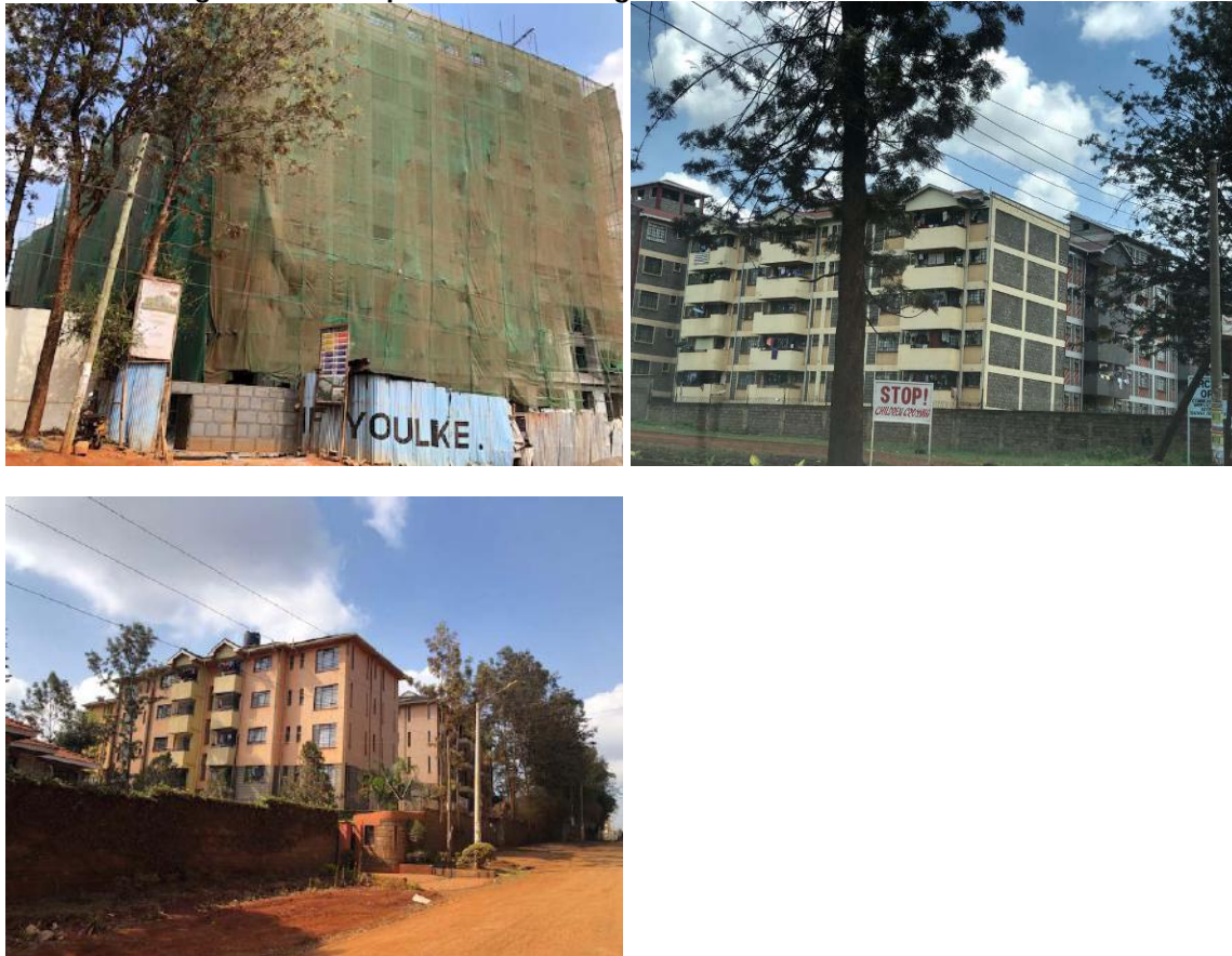
Plate 4: Some general developments in the neighborhood