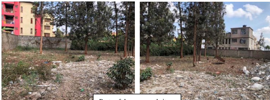
Parts of the proposed site

(GPS Coordinates: Latitude 1° 12'16.7"S, Longitude 36° 50'13.4"E)