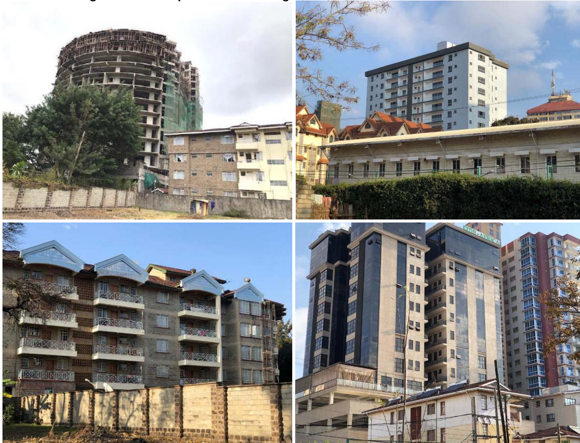
Plate 3: Some general developments in the neighborhood