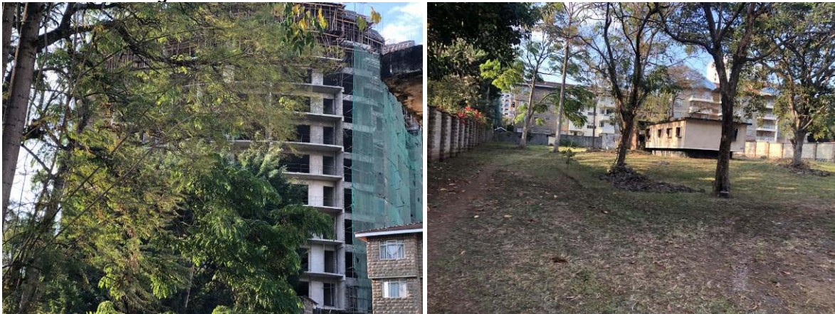
Plate 1: Part of vegetation at the site

There is no fauna/wildlife threatened by the development.