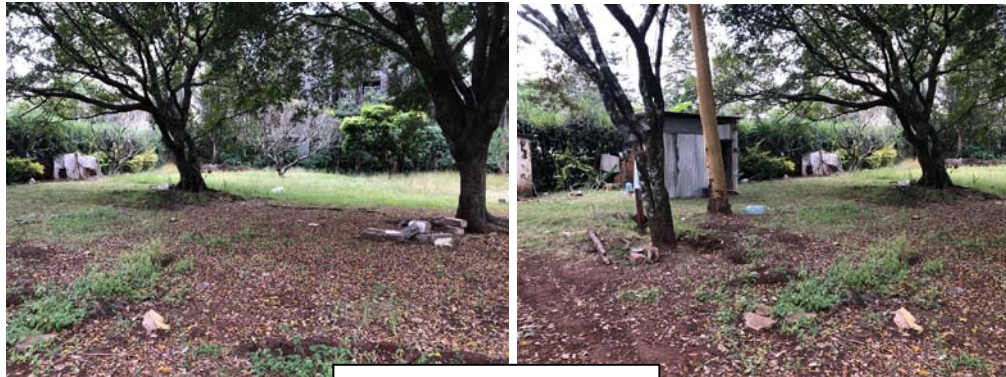
Parts of the proposed site

GPS COORDINATES: 1°17'28.0"S; 36°46'54.5"E