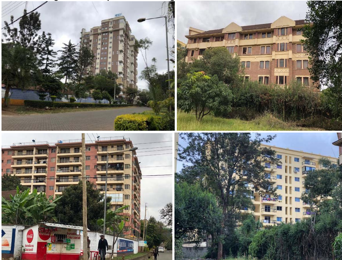
Plate 3: Some general developments in the neighborhood

planning, minimum habitable rooms, basic facilities, health and safety) have been met. The land is registered in the name of the proponent. (Please find the attached ownership documents). Similar high rise developments have been implemented in the immediate neighborhoods and others are under construction in the general neighborhood.