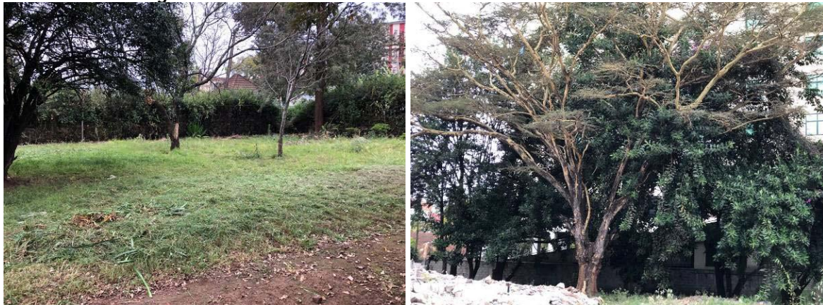
Plate 1: Part of vegetation at the site

There is no fauna/wildlife threatened by the development.