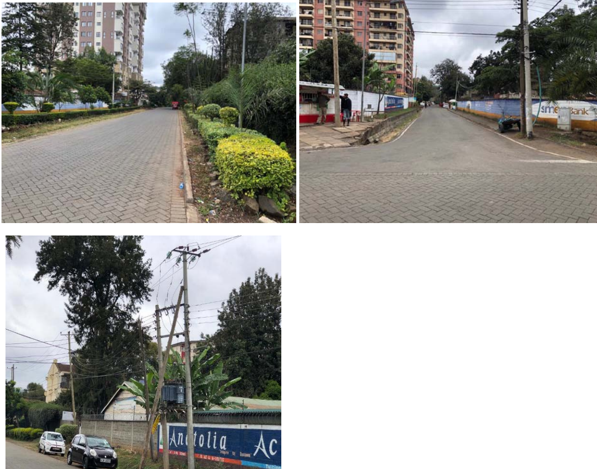
Plate 2: Part of infrastructure in the area

The immediate access road (Kirichwa Road) is tarmacked & cabro and well connected to other roads and therefore the site is well accessible.