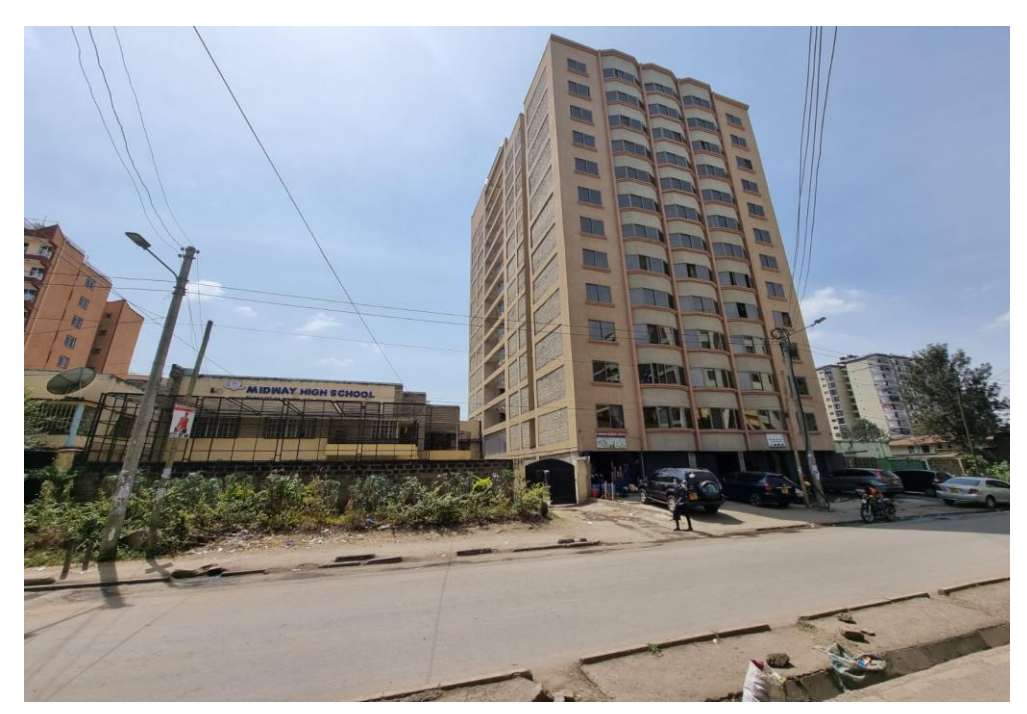
Photo 2: Showing status of the Road (Hombe Road) used to access the proposed site. There are development of similar character and magnitude near the proposed site.

The proposed site is located along Eastleigh 2<sup>nd</sup> Avenue Street. The proponent will use the same road to access the proposed site.