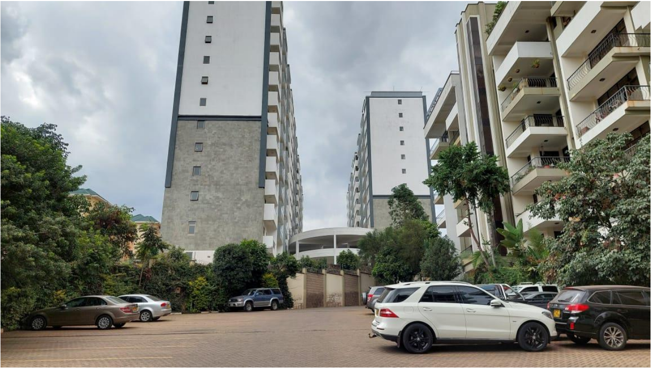
Figure 2: Neighbouring similar development

The site falls within a residential area with several apartments and associated developments including a road network, electricity supply and other infrastructure. It is accessed through a well tarmacked road.