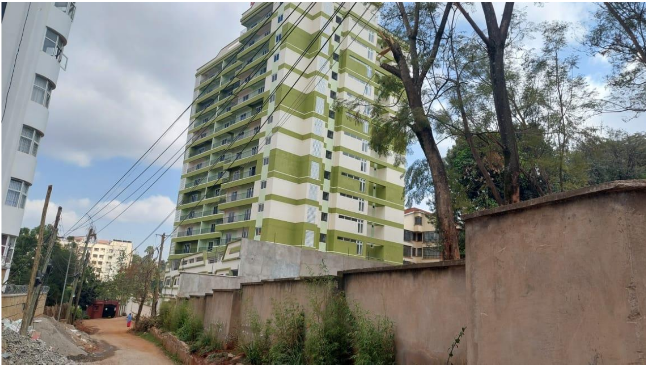
Figure 3: Access road and electricity supply to the project area