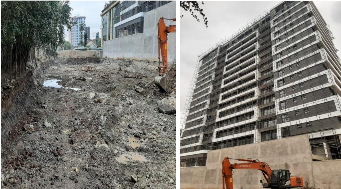
Figure 1. Project site and project neighbour respectively

Lehome Company Limited owns the piece of land LR 1/522, along Wood Avenue, Nairobi County on coordinates (-1.294161, 36.786185). The development proponent has obtained a change of use to enable them put up the multi dwelling (apartments) on land that was previously for single dwelling residential use and has been demolished to pave way for the incoming development if approved. Most neighbouring plots to the development have been developed into high rise residential apartments and offices. The surrounding area is highly developed with high-rise developments offices, residential apartments among others.