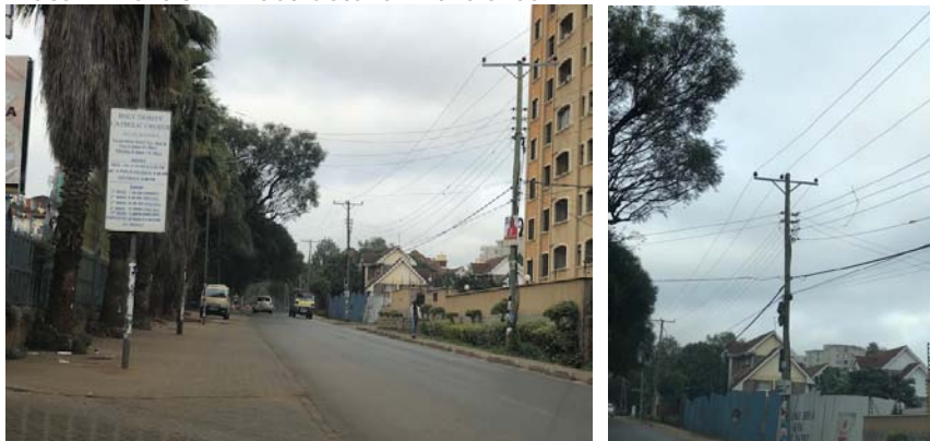
Plate 2: Part of infrastructure in the area

The immediate access road (Nyeri Road) is tarmacked and well connected to other roads and therefore the site is well accessible.