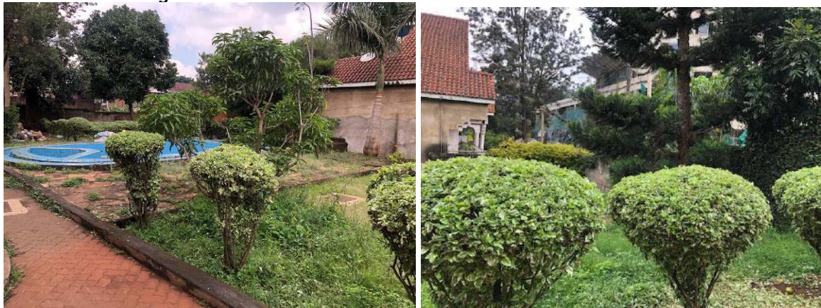
Plate 1: Part of vegetation at the site

There is no fauna/wildlife threatened by the development.