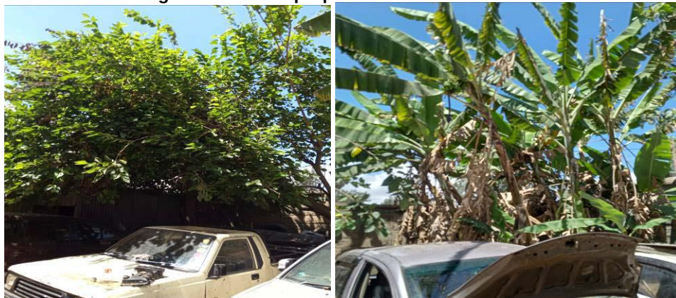
Plate 1: Part of vegetation on the proposed site

There is no fauna/wildlife threatened by the development.