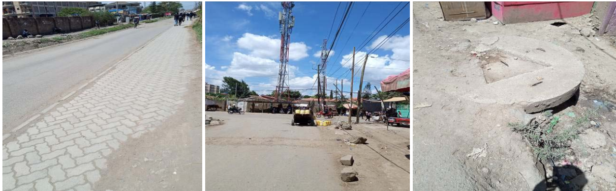
Plate 2: Part of infrastructure in the area

The immediate access is tarmacked and joins Fedha and Airport North Roads and therefore the site is well accessible.