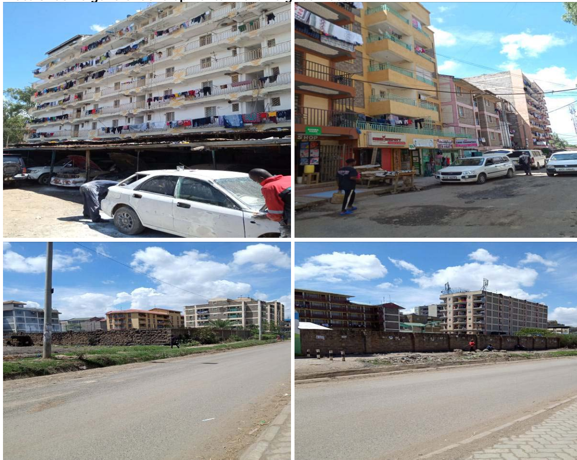
Plate 3: Some general developments in the neighborhood

Similar high rise developments have been implemented in the immediate neighborhoods and others are under construction in the general neighborhood.