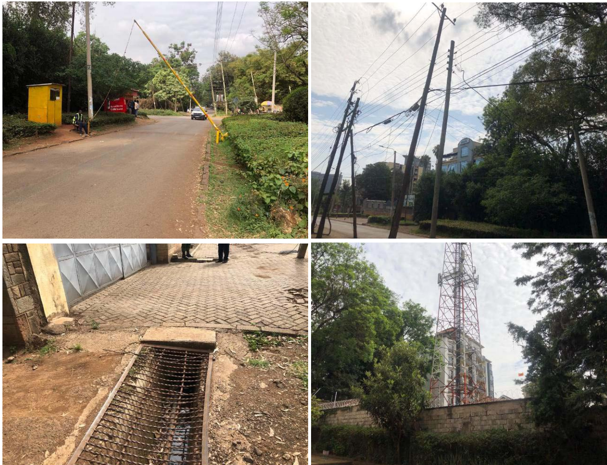
Plate 2: Part of infrastructure in the area

The immediate access is tarmacked and Westlands Avenue and Waiyaki Way Roads and therefore the site is well accessible.