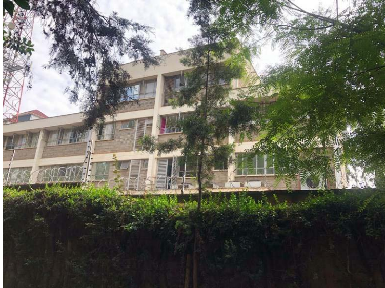
Plate 3: Some general developments in the neighborhood

Similar high rise developments have been implemented in the immediate neighborhoods and others are under construction in the general neighborhood.