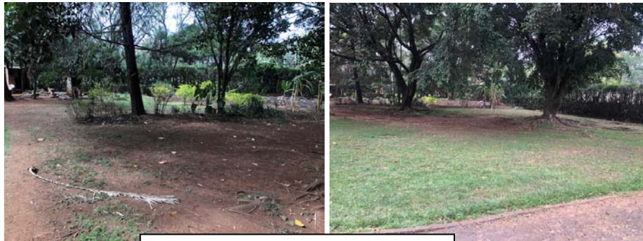
Parts of the proposed site

(GPS Coordinates: Latitude 1°15'50.1"S, Longitude 36°47'47.3"E)