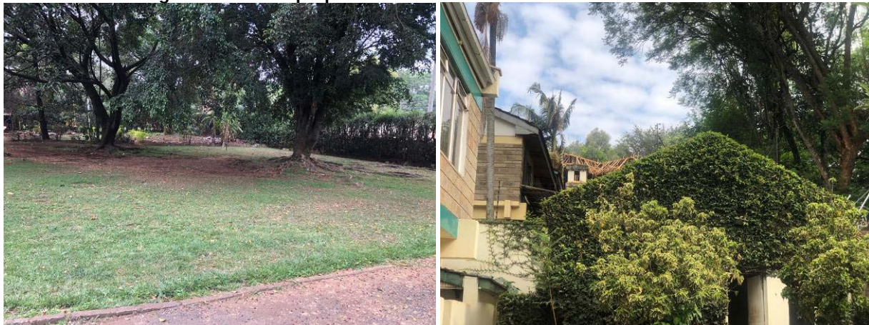
Plate 1: Part of vegetation on the proposed site

There is no fauna/wildlife threatened by the development.