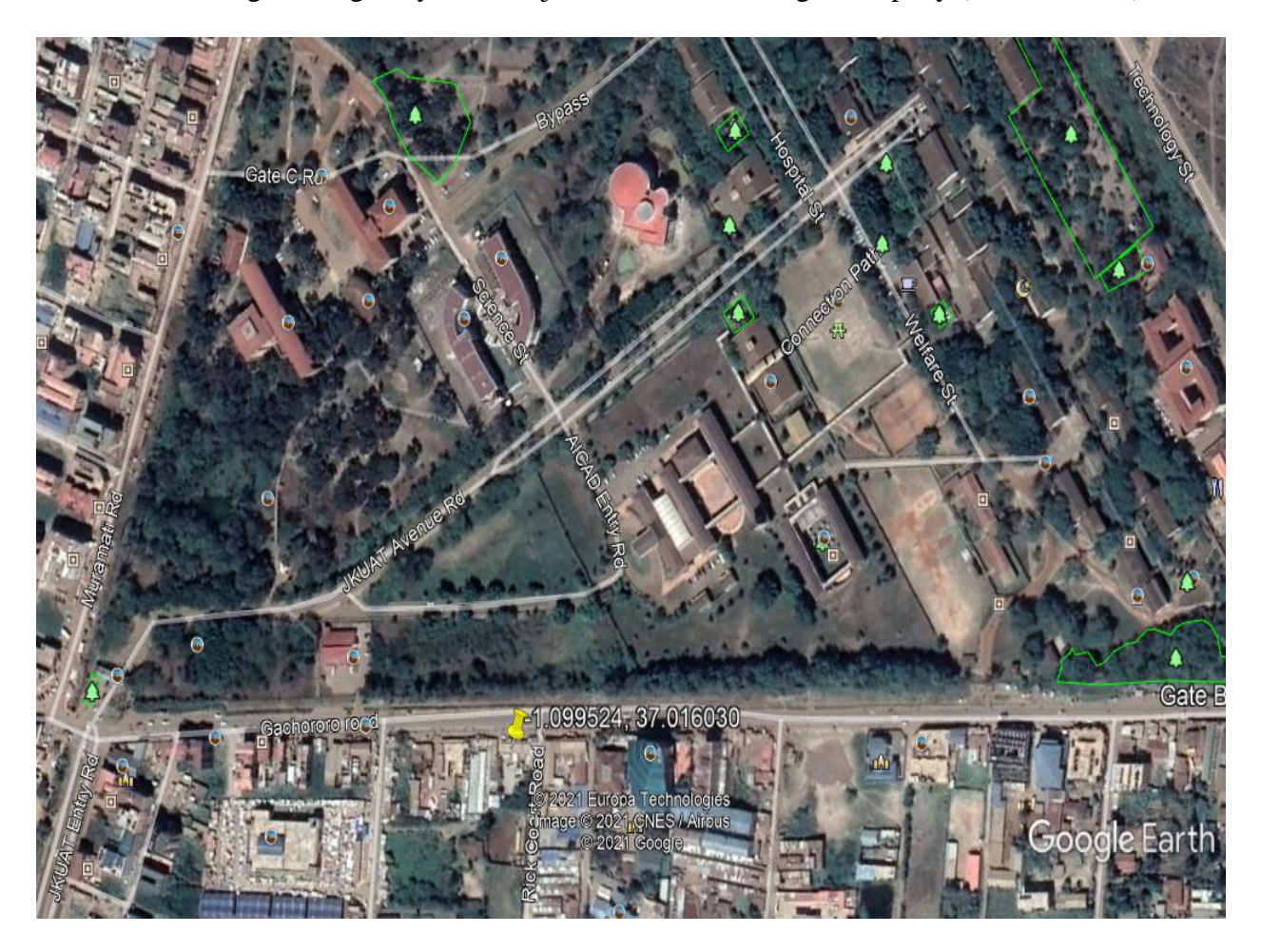
Figure 1: Map of Proposed project site (300 meters from JKUAT)

The corner plot is served by two access roads making entry and exit from the premises convenient and is a stone throw away from the JKUAT University being the project's primary target. The site is served by tarmacked Gachororo road, existing power connection, piped fresh water and sewerage managed by Ruiru Juja Water and Sewerage Company (RUJWASCO).