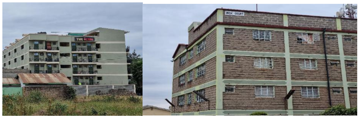
Figure 5; Similar developments around the proposed site in Juja