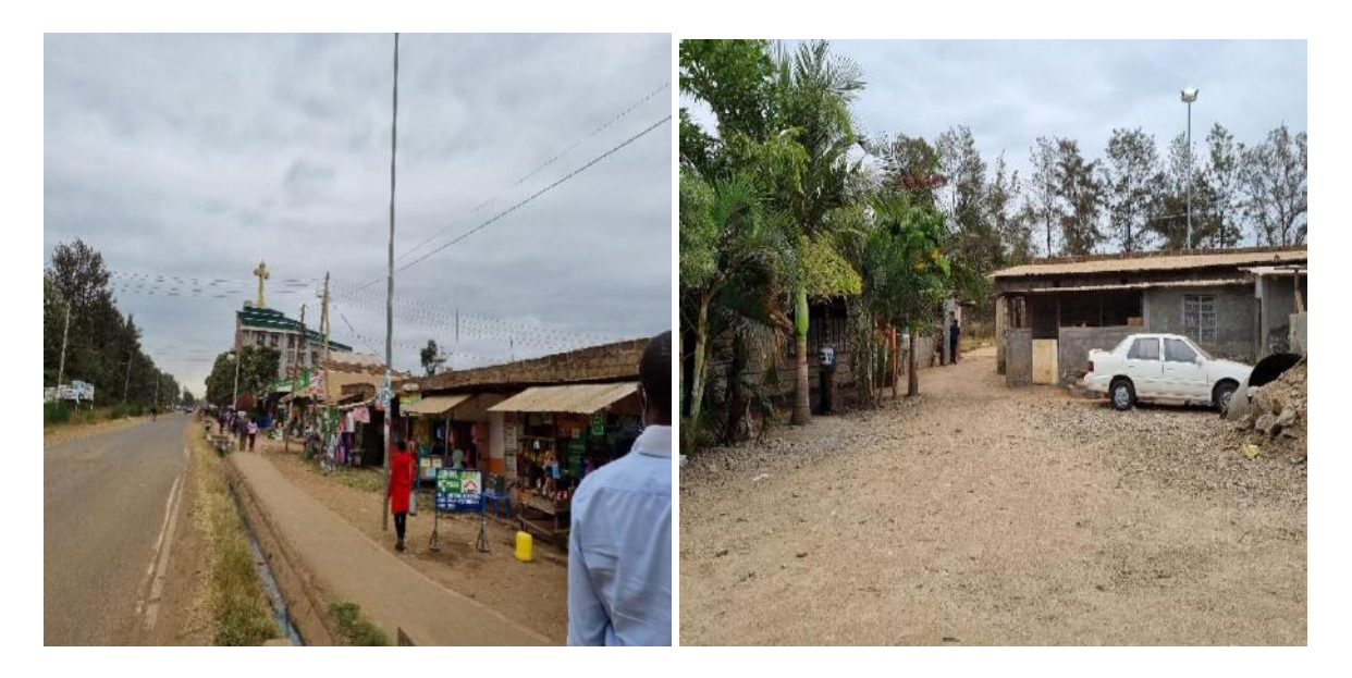
Figure 2: Photos of Proposed project site (300 meters from JKUAT)