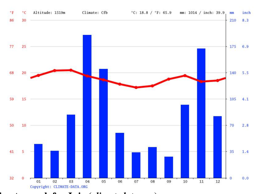
Figure 3: Climate graph for Juja (climatedata.org)

The project area is located along Gachororo Road, Juja, off Thika Road, opposite JKUAT University off Thika road, Kiambu County. Juja's climate is classified as warm and temperate. There is significant rainfall throughout the year in Juja. Even the driest month still has a lot of rainfall. This climate is considered to be Cfb according to the Köppen-Geiger climate classification. The temperature here averages 18.8 °C | 65.9 °F. In a year, the rainfall is 1014 mm | 39.9 inch.