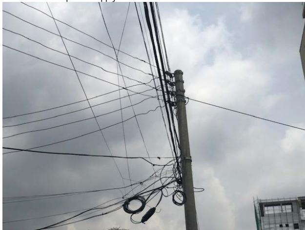
Plate 3: Parts of power supply network in the area

The area is well covered by all communication facilities such as landline and mobile services. All these will facilitate communication throughout the project cycle.