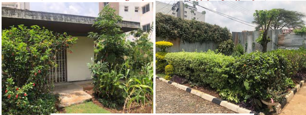
Parts of the proposed site and some of the structures to be demolished

(GPS Coordinates: (Wgs 84 Datum) 1°17'44.4"S; 36°47'11.9"E)