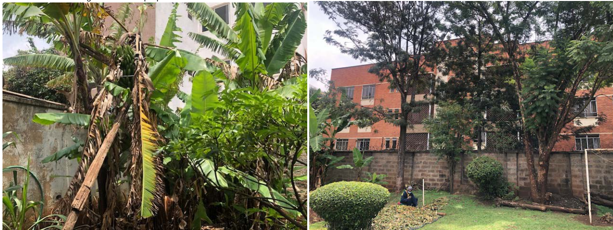
Plate 1: Part of the vegetation at the proposed site

The general area is planted with vegetation (trees) mostly along the roads, plot boundaries and in designated gardens within the respective plot boundaries. The proposed site has planted vegetation but none is of special conservation or cultural importance.