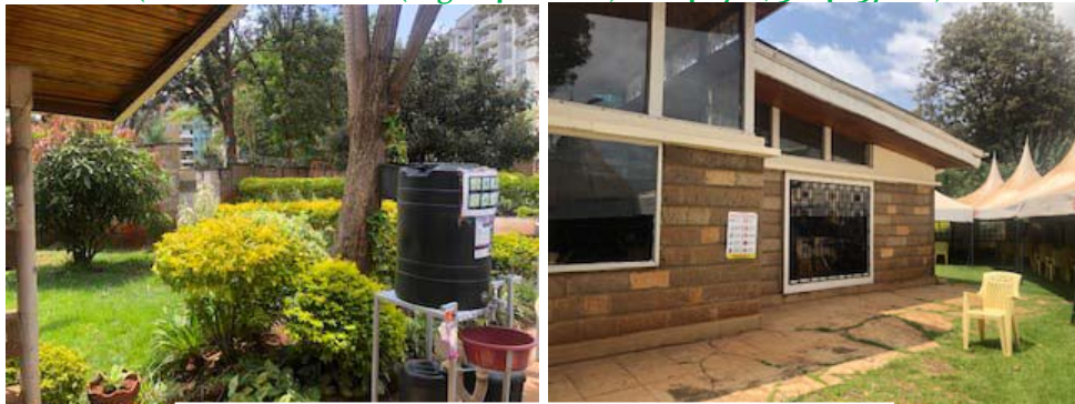
Parts of the proposed site and some of the structures to be demolished

(GPS Coordinates: (Wgs 84 Datum) 1°16'48.7"S; 36°46'57.1"E)