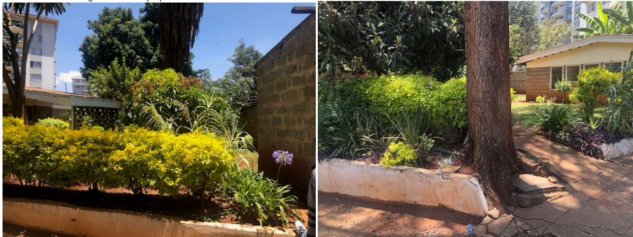
Plate 1: Part of the vegetation at the proposed site

The general area is planted with vegetation (trees) mostly along the roads, plot boundaries and in designated gardens within the respective plot boundaries. The proposed site has planted vegetation but none is of special conservation or cultural importance.