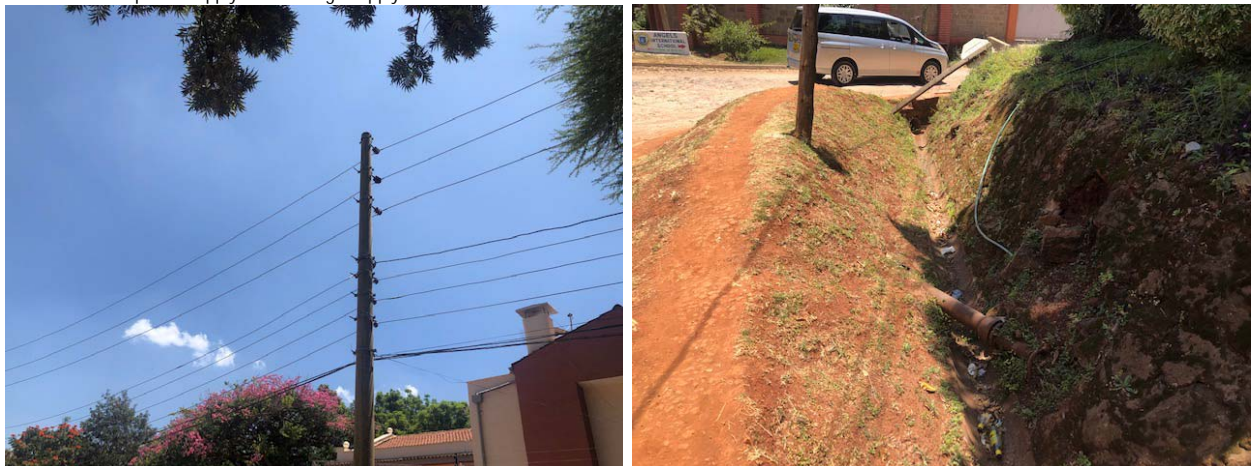
Plate 3: Parts of power supply and drainage supply network in the area

The area is well covered by all communication facilities such as landline and mobile services. All these will facilitate communication throughout the project cycle.