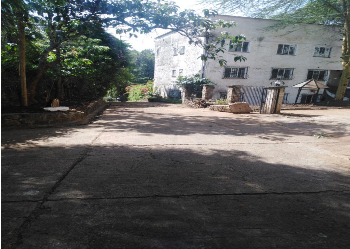
Plate 2: Proposed construction site with existing building to be demolished