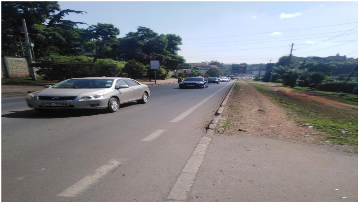
Plate 3: Access road to the site - Ring Road