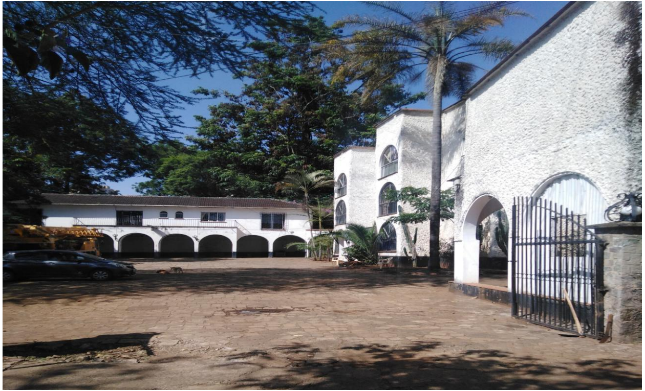
Plate 4: Existing buildings on the proposed site to be demolished