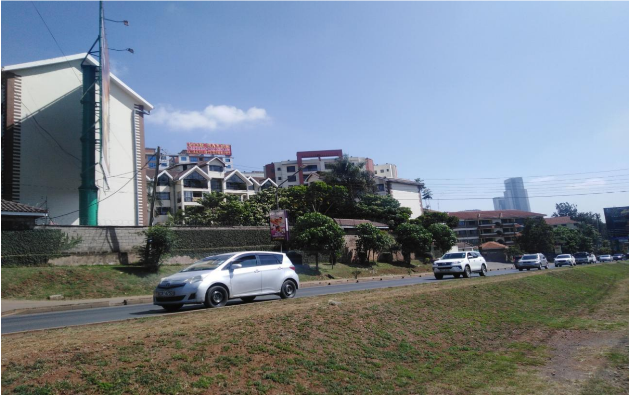
Plate 5: Immediate neighbourhood - Sunny hills and Bellway apartments among others