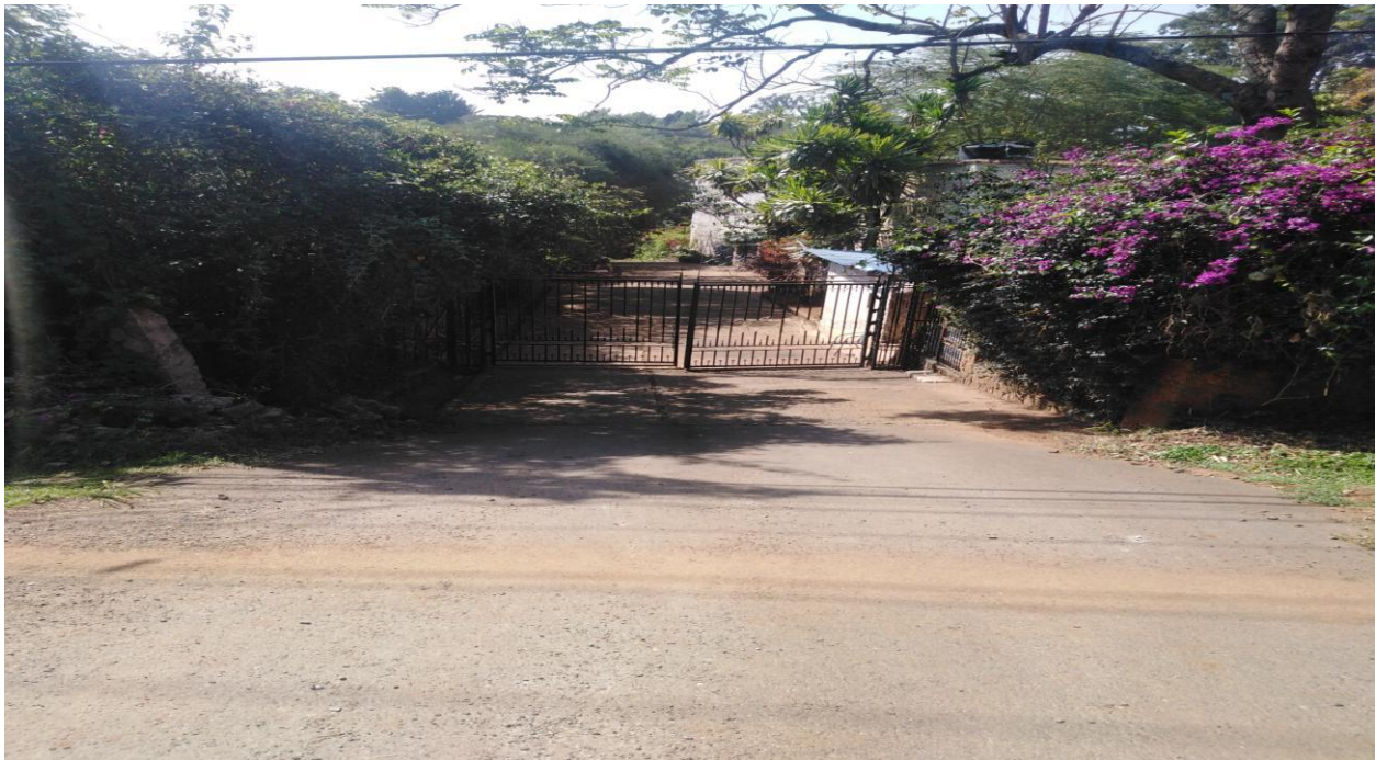
Plate 6: Vegetation on site and access gate into the site