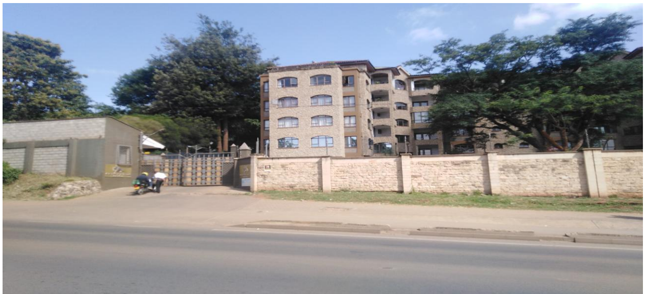
Arboretum Manor Apartments directly opposite the proposed site