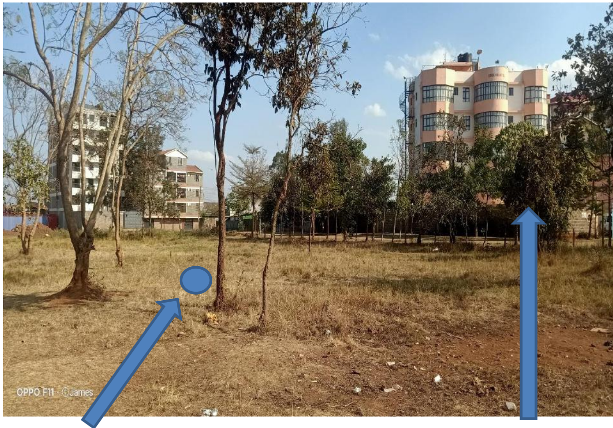
Site for the proposed residential units.