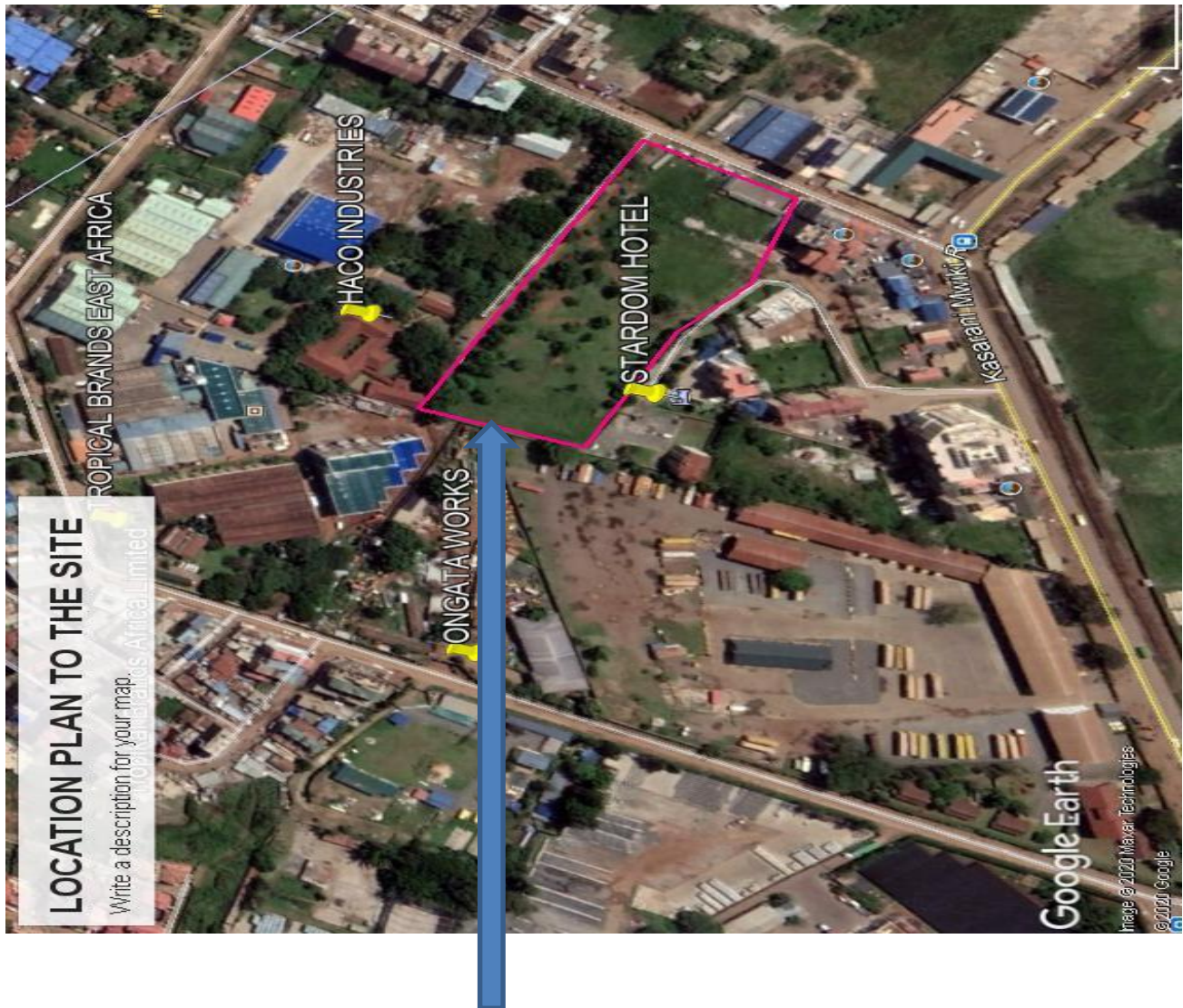
LOCATION OF THE SITE FOR THE PROPOSED AFFORDABLE HOUSING PROJECT