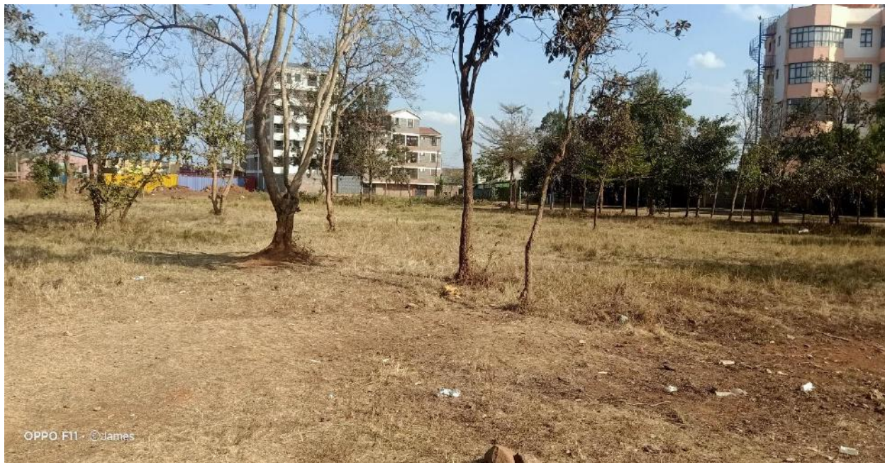
Site for the proposed Housing project in Mwiki –Kasarani area.