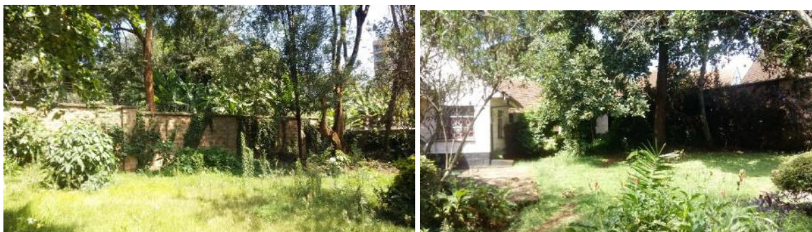
Plate 2: Other views of the project site