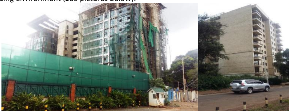
Plate 3: Similar apartment buildings within the proposed site surroundings

The proposed project shall therefore be consistent with the mixed development nature of the surrounding environment (See pictures below).