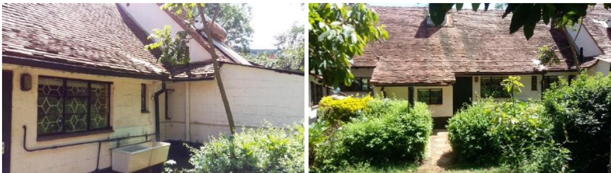
Plate 1: A view of the proposed project site

The proposed project site was previously occupied by single storey vacant residential house that has since been demolished. The project plot is surrounded by a masonry stone wall and overgrown hedge boundary and borders. There are several mature trees within the proposed plot which is rich in vegetation including various flowers and grass lawns. The area is served by NW&SCo piped water and sewer line connection as well as KPLC electricity power.