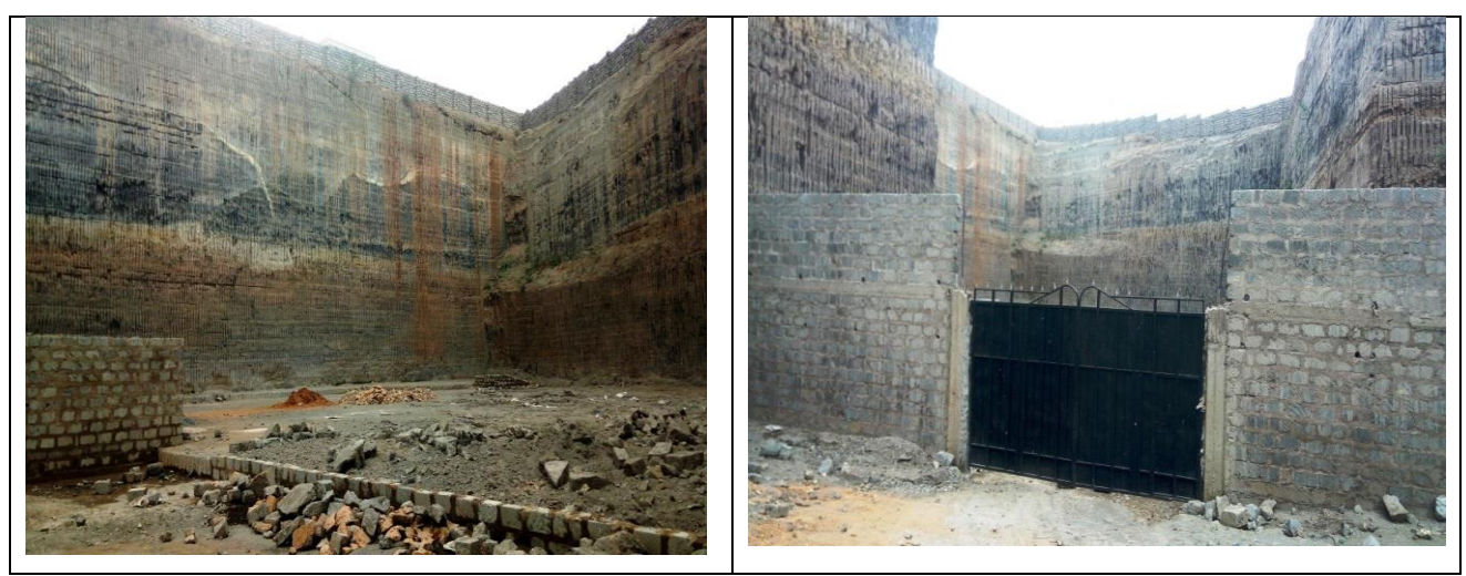
Plate 4: View of the site which is an abandoned quarry

Appendix 1 : The lease agreement for the project site.