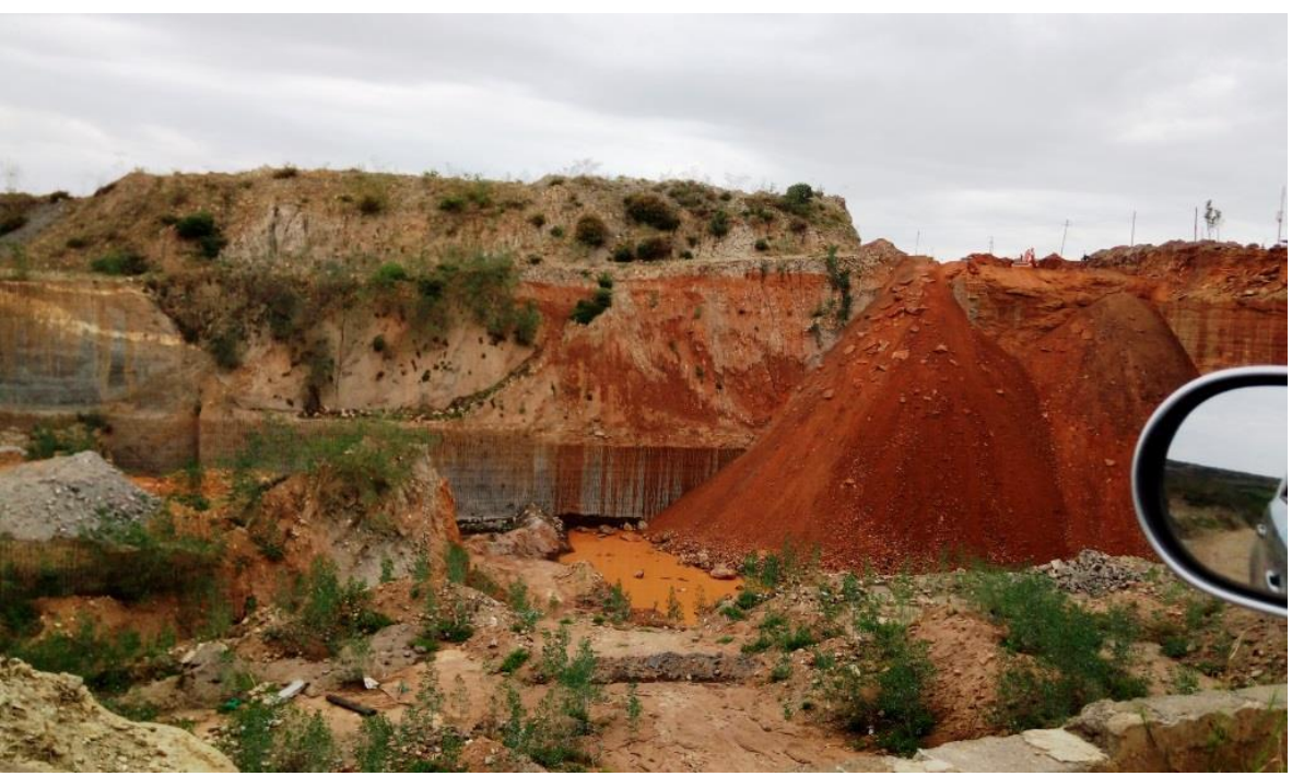
Plate 2: View of the neighbouring site