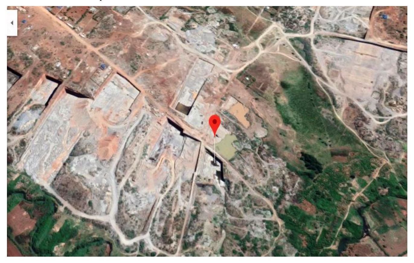
Figure 1: 3D Satellite view of the location of the proposed site on google map. The surrounding area to the site are either abandoned quarries or active mines.

The proposed Waste incinerator on plot no. LR No. JUJA/JUJA EAST BLOCK 1/2748 in Nyacaba, Juja Sub-County Kiambu County. The proposed site is an abandoned quarry. In Nyacaba area where stone mining for construction industry is the main activity, owners leave the quarry pits open and most of the abandoned ones have been filled with a very small layer of stone rubble and dust where no further rehabilitation takes place. The quarry owners report that filling up of the quarries after use is an expensive exercise which would not translate to good profits, as the depth of the quarries is large. The proposed site measures about 50m in depth and 150m wide.