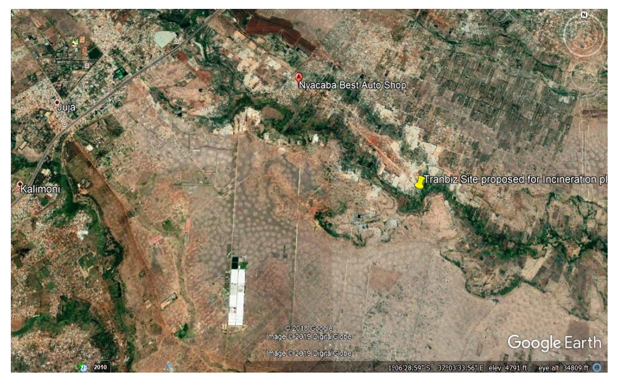
Figure 2: Satellite vie with locations

From Juja, the site can be accessed via Weitethie underpass using the service lane just after River Ndarugo bridge.