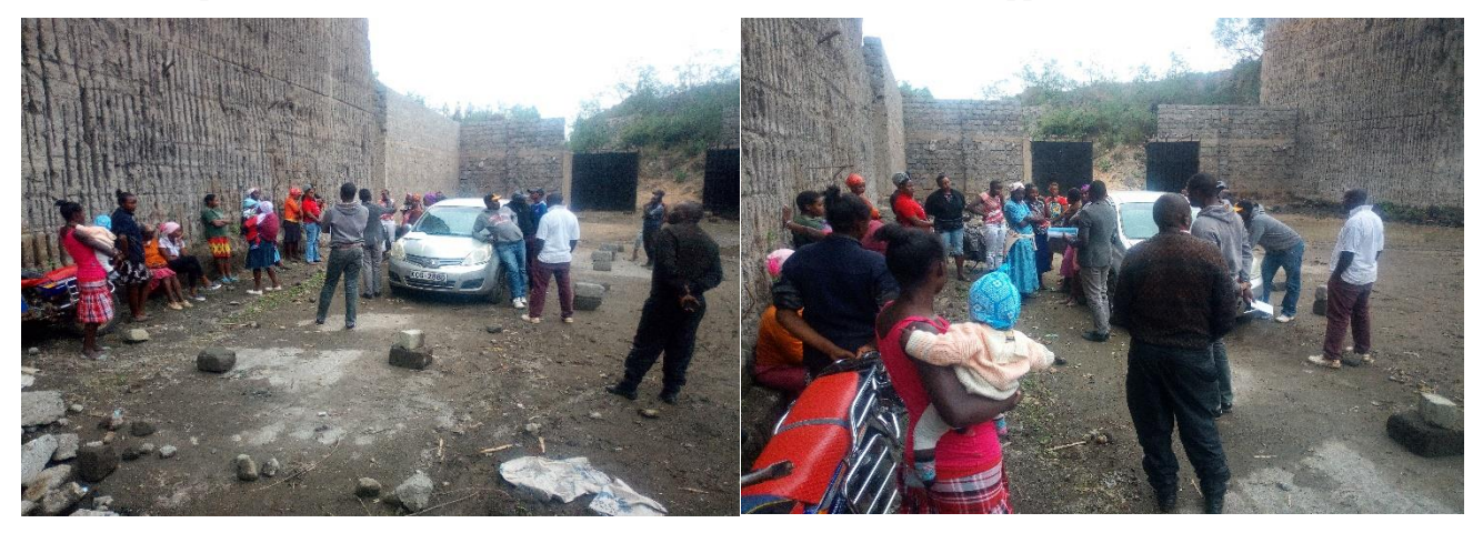
Plates showing experts engagement with the neighbors.