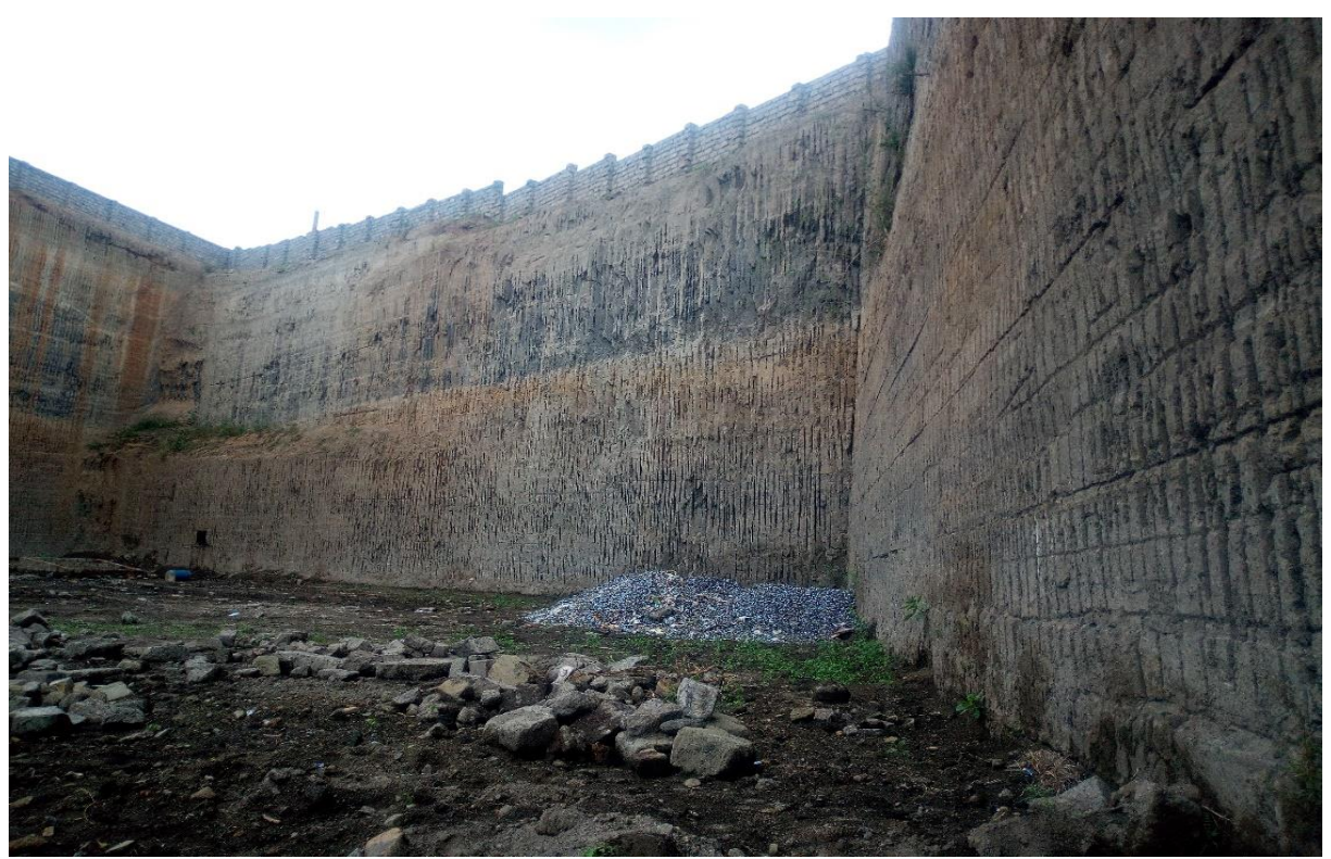
Plate 3: View of the proposed incinerator site