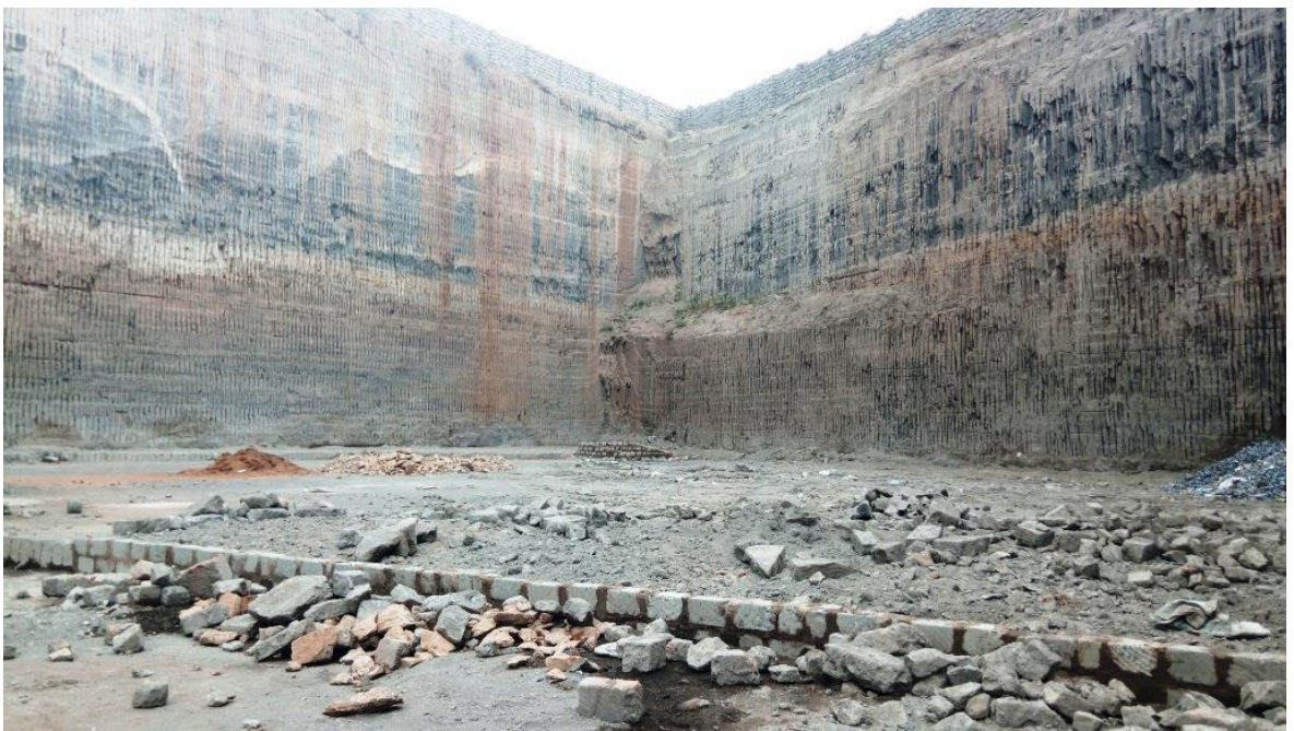
Plate 1: The proposed site for incineration plant is an abandoned quarry site.