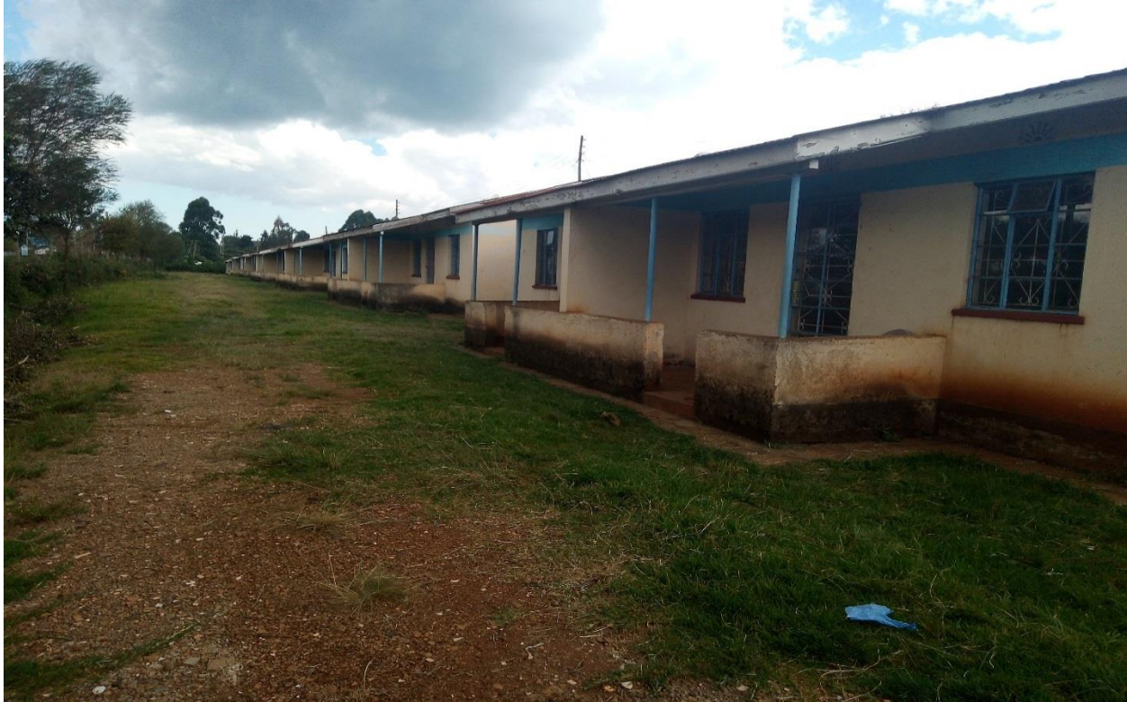
Plate 1: Current site characteristics

The site is situated along Kapsabet-Kisumu road at Kapsabet town, Nandi County.