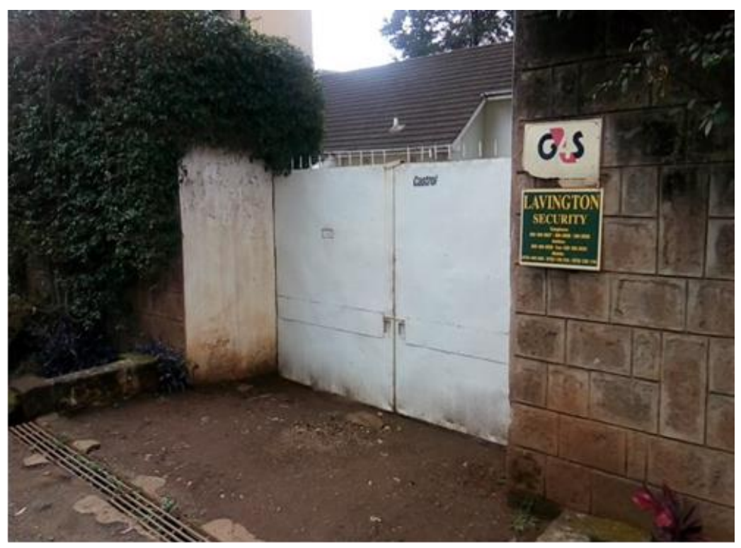
Proposed Construction Site

209/6881 ALONG GATUNDU ROAD, KILELESHWA AREA NAIROBI COUNTY.