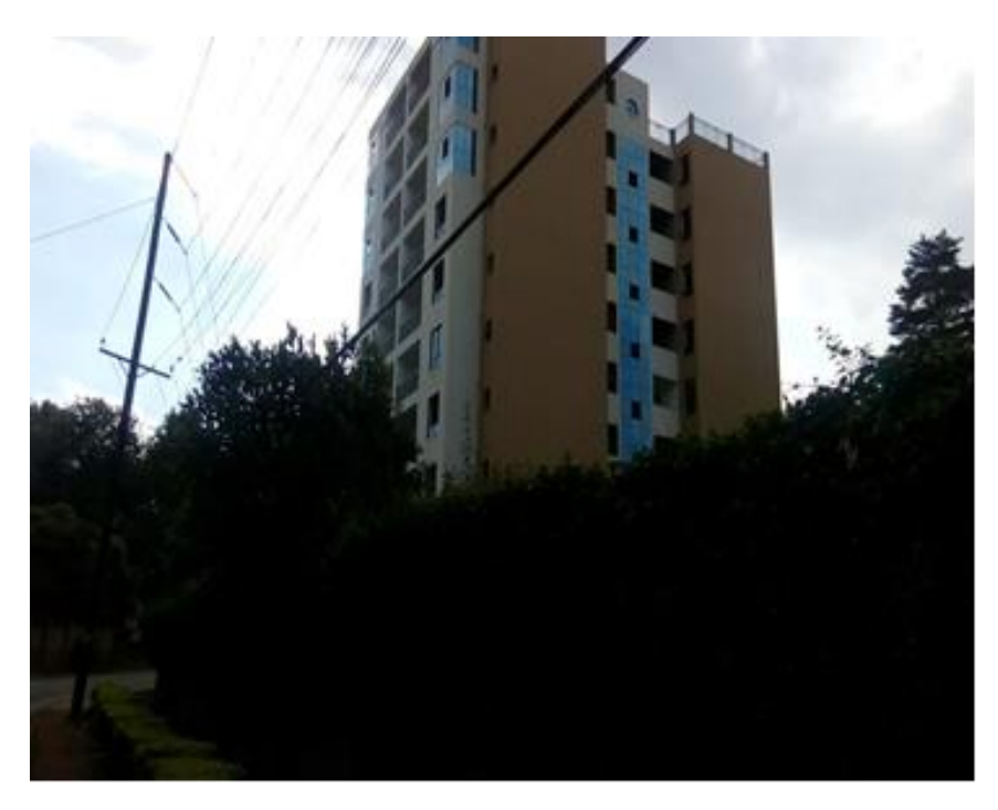
Similar developments along Gatundu road