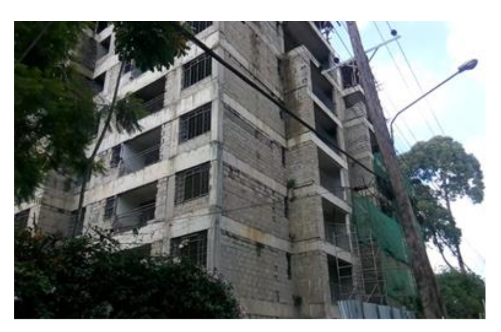
Similar immediate on-going development