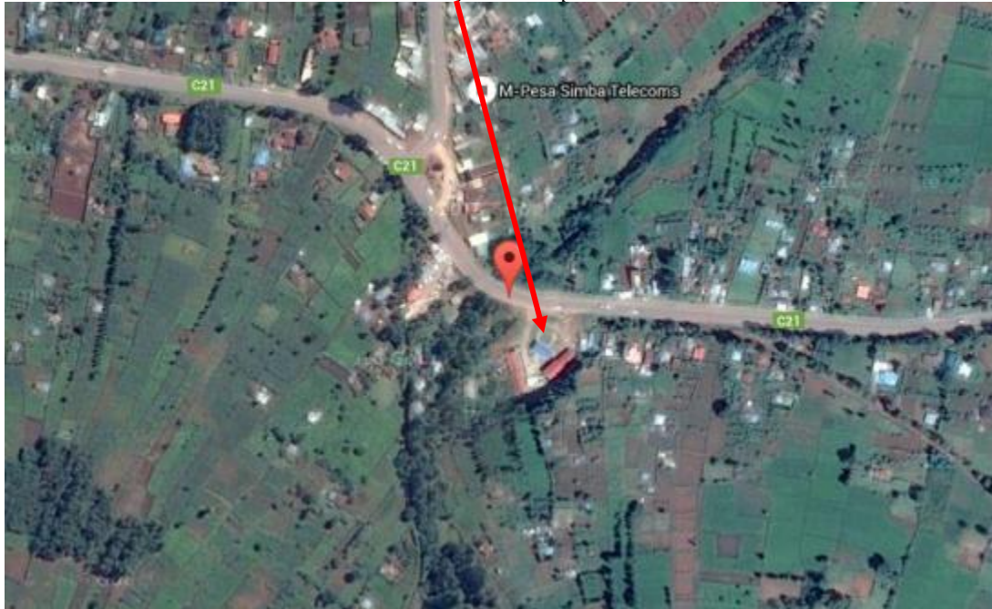
Project site map

The filling station is based on Plot No. West Mugirango/Siamani/5818 at Konate Centre in Nyamira County on GPS Coordinates latitude 0°35'0.747"S and longitude 34°56'0.155"E. The project area of approximately 0.5 acres is along the busy Kisii-Nyamira highway near Konate centre on 2031m above the sea level.