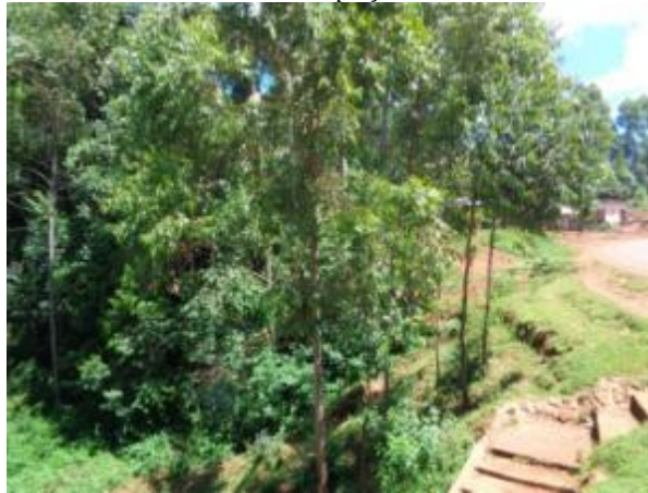
Flora at the project site